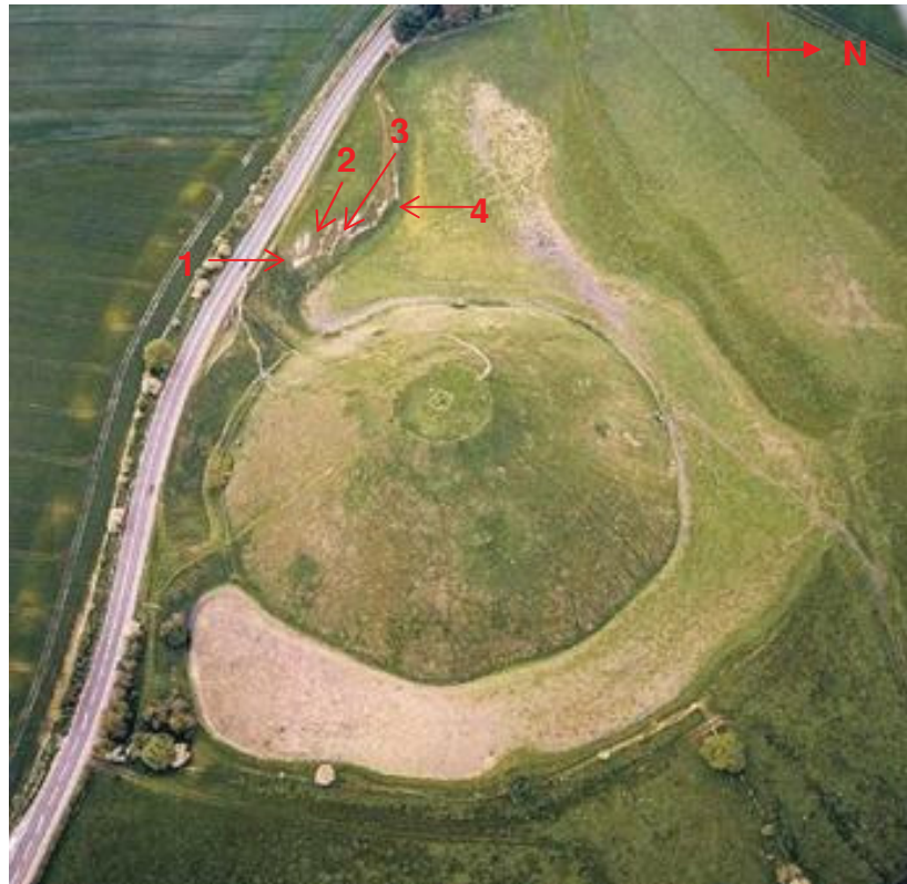
Figure 3. Annotated aerial view showing the Four Exposures of Chalk near to Silbury Hill.