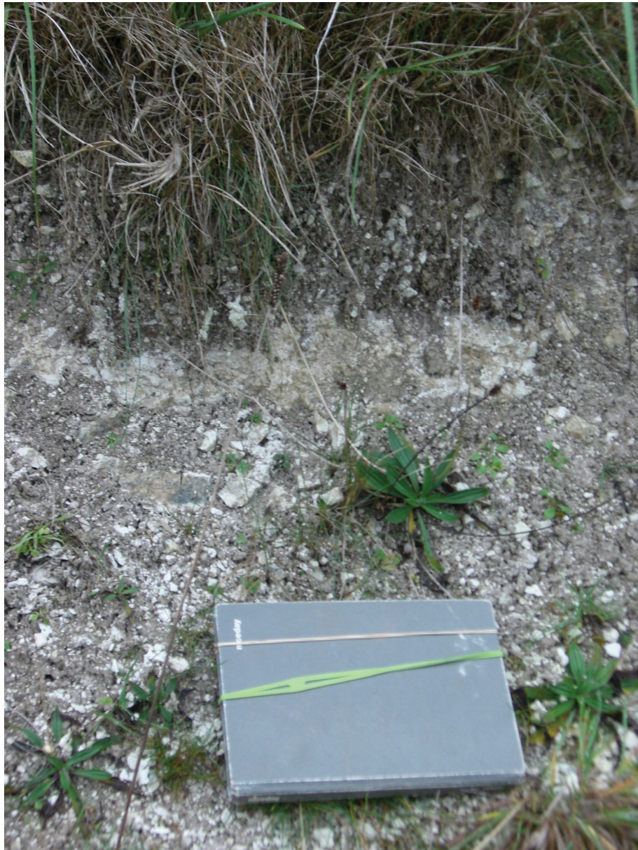
Figure 13. Right hand part of Silbury Hill Exposure 4 showing white chalk with spotted blue-grey weathering at the top of the exposure. A5 sized note book for scale (Image CIMG0344, 20/11/06).