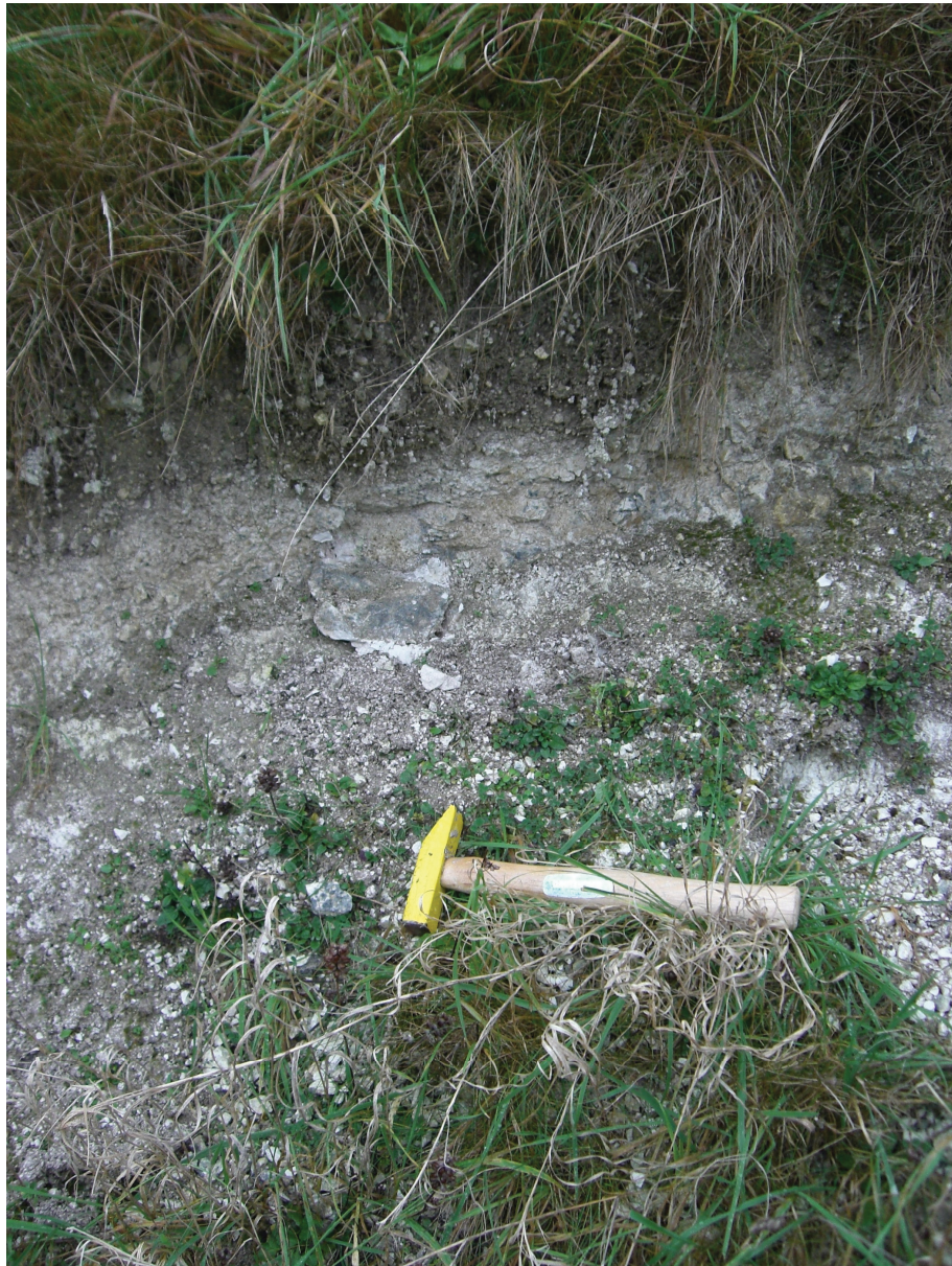
Figure 7. Centre Section of Silbury Hill Exposure 1 showing white chalk weathered blue-grey in the upper part of the exposure (Image CIMG0336, 20/11/06).