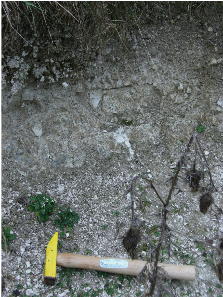
Figure 9. Centre Section of Silbury Hill Exposure 1 showing white chalk with spotted blue-grey weathering at the top of the exposure (Image CIMG0339, 20/11/06).