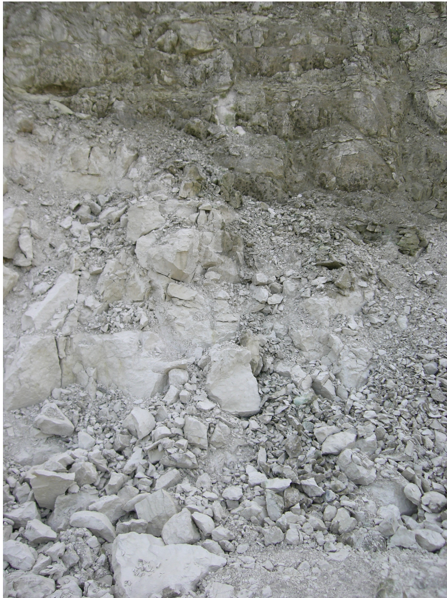
Figure 15. Beggar's Knoll Quarry Exposure B showing the Holywell Nodular Chalk Member of the Middle Chalk Formation. Note the difference in colour between the brownish-grey coloured weathered chalk in the top right of the view compared to the off-white of the fresh chalk (Image CIMG0357, 13/12/06).