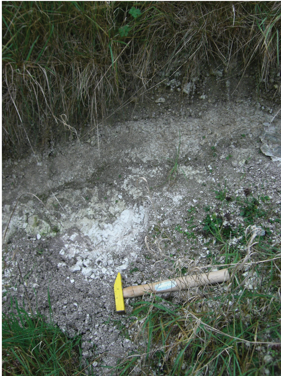
Figure 8. Centre Section of Silbury Hill Exposure 1 showing white chalk weathered creamy-buff in the lower part of the exposure (Image CIMG0337, 20/11/06).