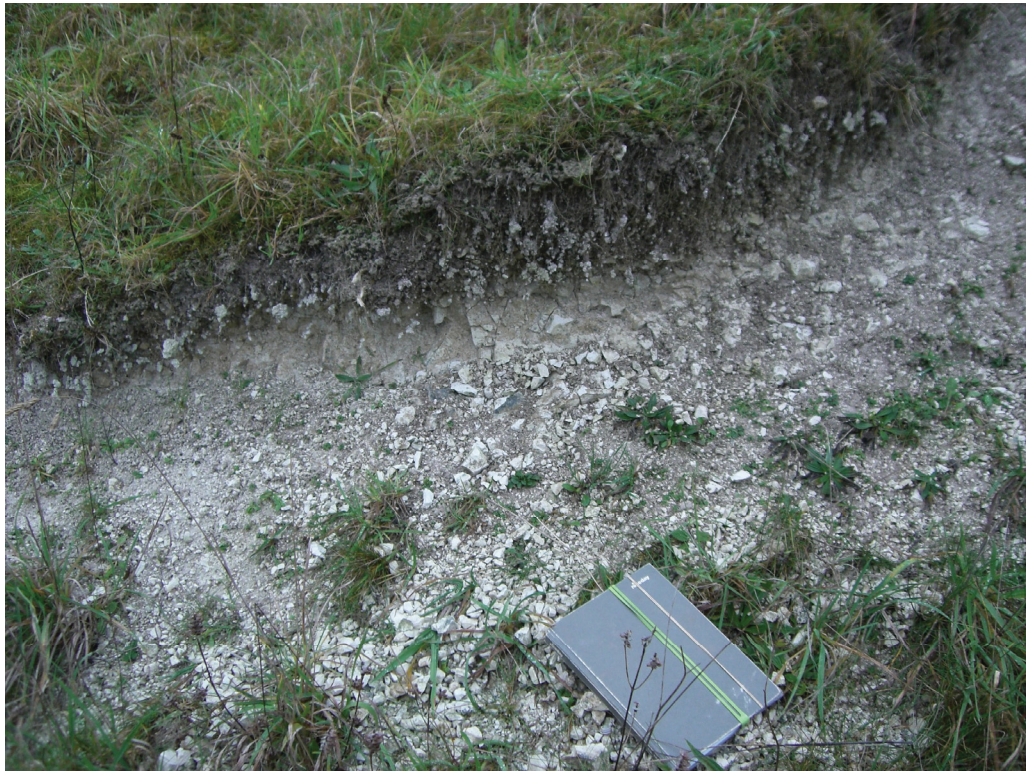
Figure 10. Silbury Hill Exposure 2 looking South showing white chalk weathered creamy-buff with A5 sized note book for scale (Image CIMG0340, 20/11/06).