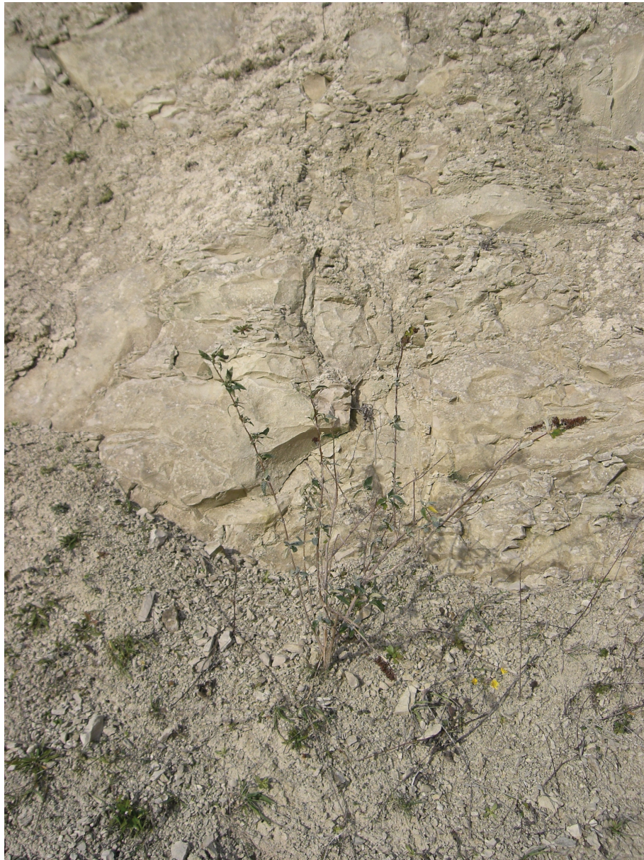
Figure 21. Beggar's Knoll Quarry Exposure D showing a view of the grey chalk in the Zig Zag Chalk Member of the Lower Chalk Formation (Image CIMG0363, 13/12/06).