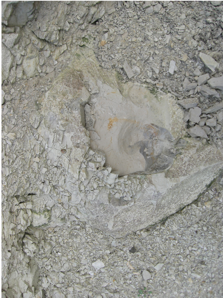
Figure 20. Beggar's Knoll Quarry Exposure C showing a view of the Plenus Marls (Image CIMG0362, 13/12/06).