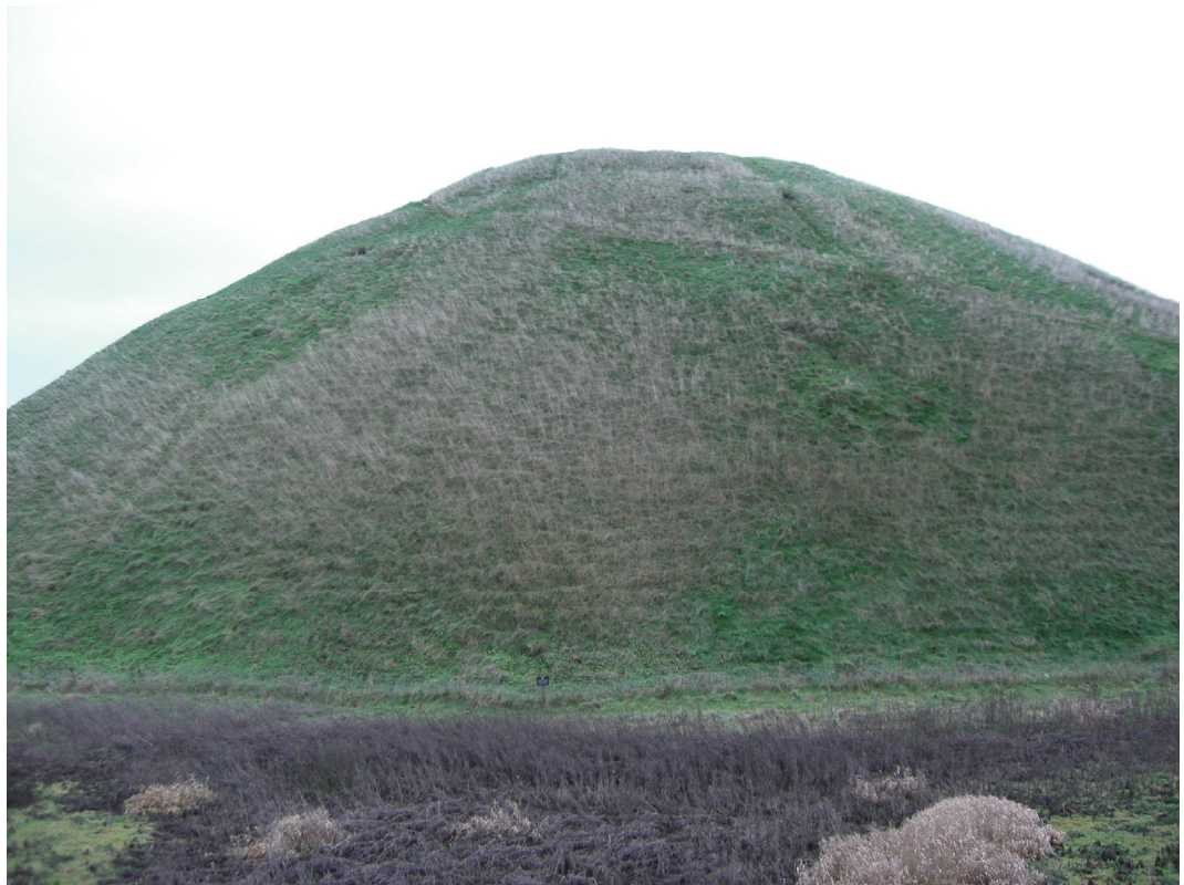
Figure 5. Silbury Hill looking NE from Exposure 3 (CIMG0342, 20/11/06).