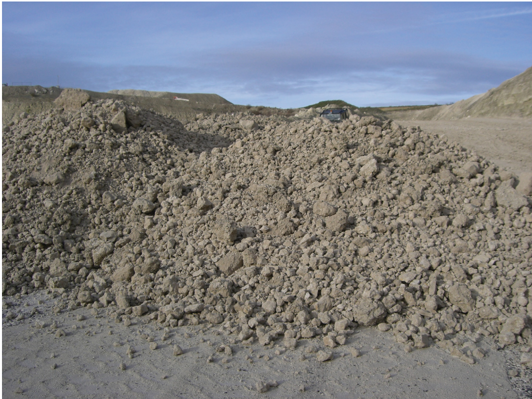
Figure 17. Pile of Chalk Nodules from the Melbourn Rock at the base of the Middle Chalk Formation in one of the access roads at Beggar's Knoll Quarry (Image CIMG0359, 12/12/06).