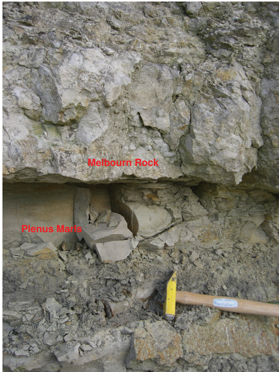
Figure 18. Beggar's Knoll Quarry Exposure C showing the boundary between the Melbourn Rock (Middle Chalk Formation) and the underlying Plenus Marls (Lower Chalk Formation) with a geological hammer for scale (Image CIMG0360, 13/12/06).