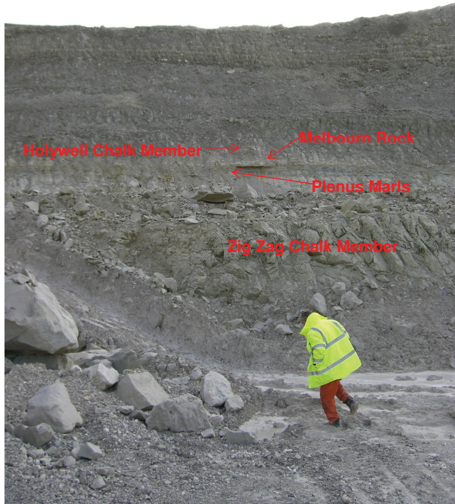
Figure 16. Beggar's Knoll Quarry showing a view of the Middle and Upper Chalk Formations. Part of the Melbourn Rock at the base of the Middle Chalk Formation can be seen overhanging the underlying Plenus Marls at the top of the Lower Chalk Formation (Image CIMG0358, 13/12/06).