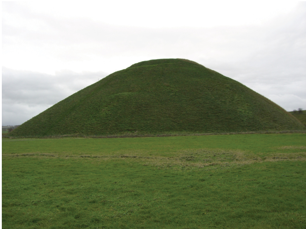
Figure 1. Silbury Hill looking South-East (Image CIMG0351, 20/11/06).