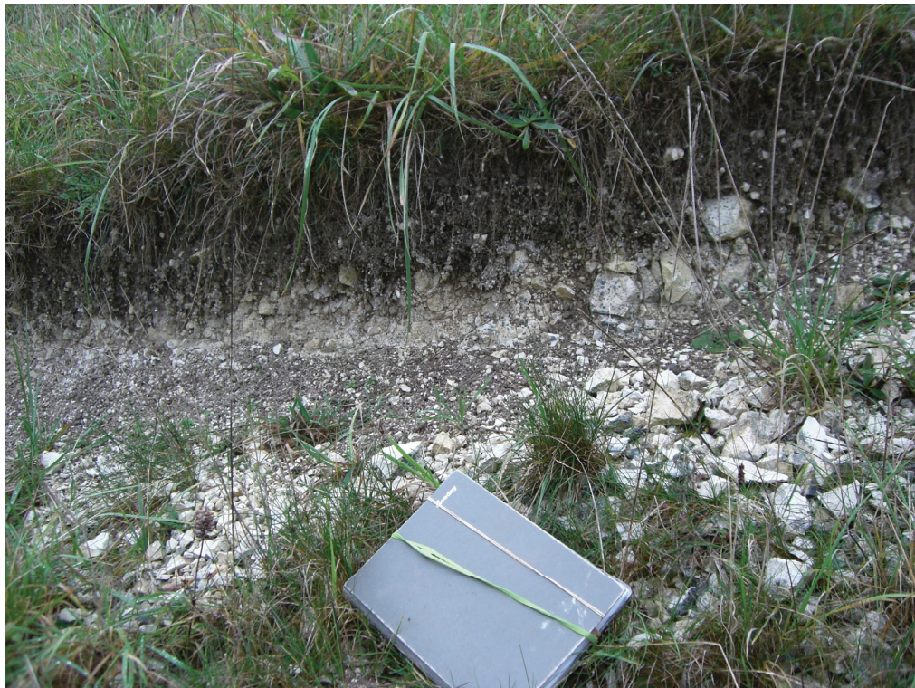
Figure 11. Silbury Hill Exposure 3 looking South showing white chalk generally weathered creamy-buff. A5 sized note book for scale (Image CIMG0341, 20/11/06).