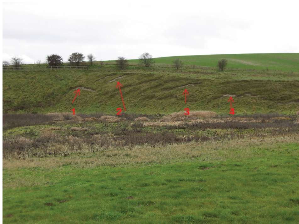
Figure 4. View of the Steep Face showing the Four Exposures of Chalk near to Silbury Hill (Image CIMG0348, 20/11/06).