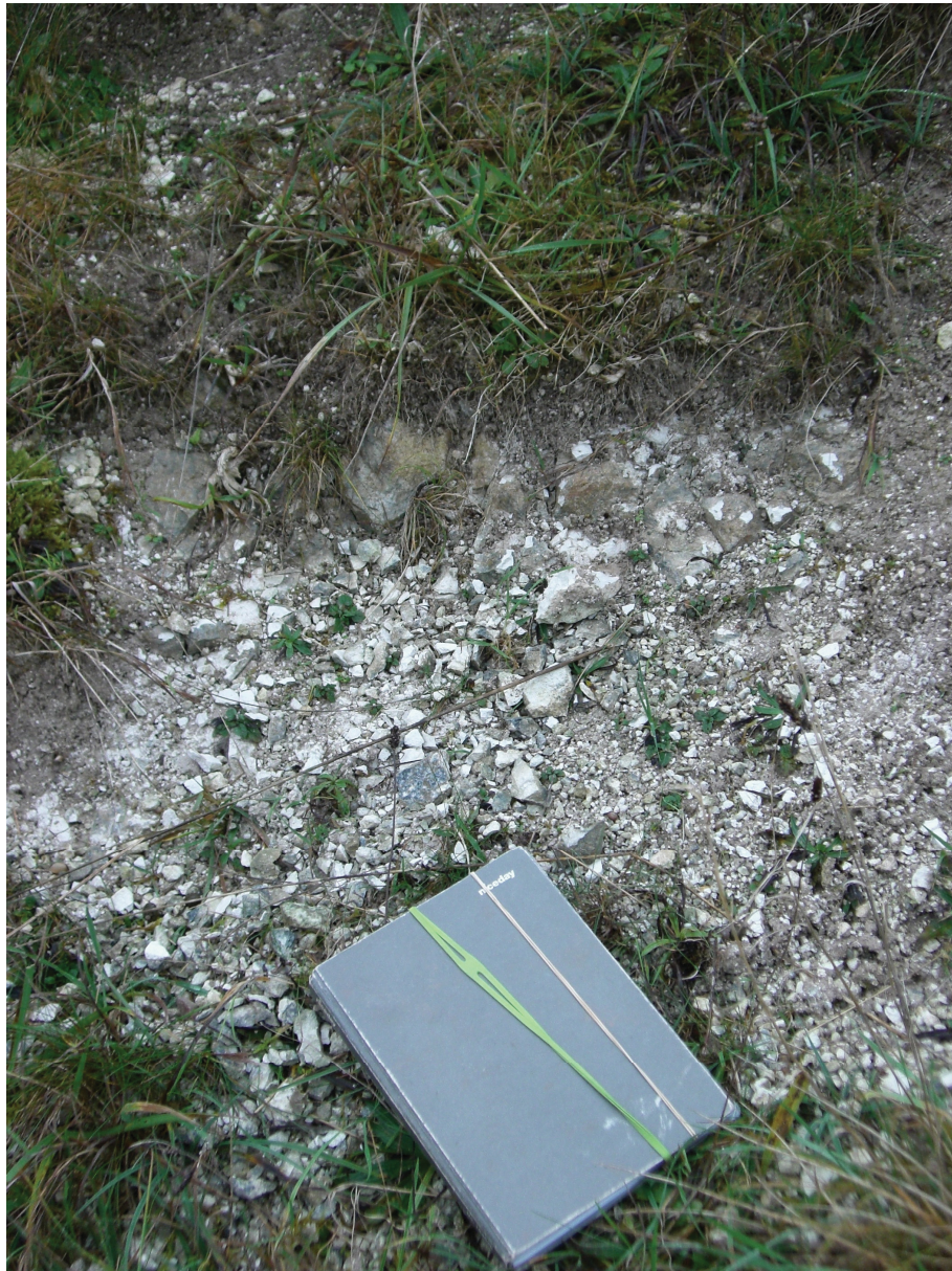
Figure 12. Left hand part of Silbury Hill Exposure 4 showing white chalk weathered creamy-buff. Note the light brown coloured 0.05m thick block band of chalk just below the topsoil. A5 sized note book for scale (Image CIMG0343, 20/11/06).