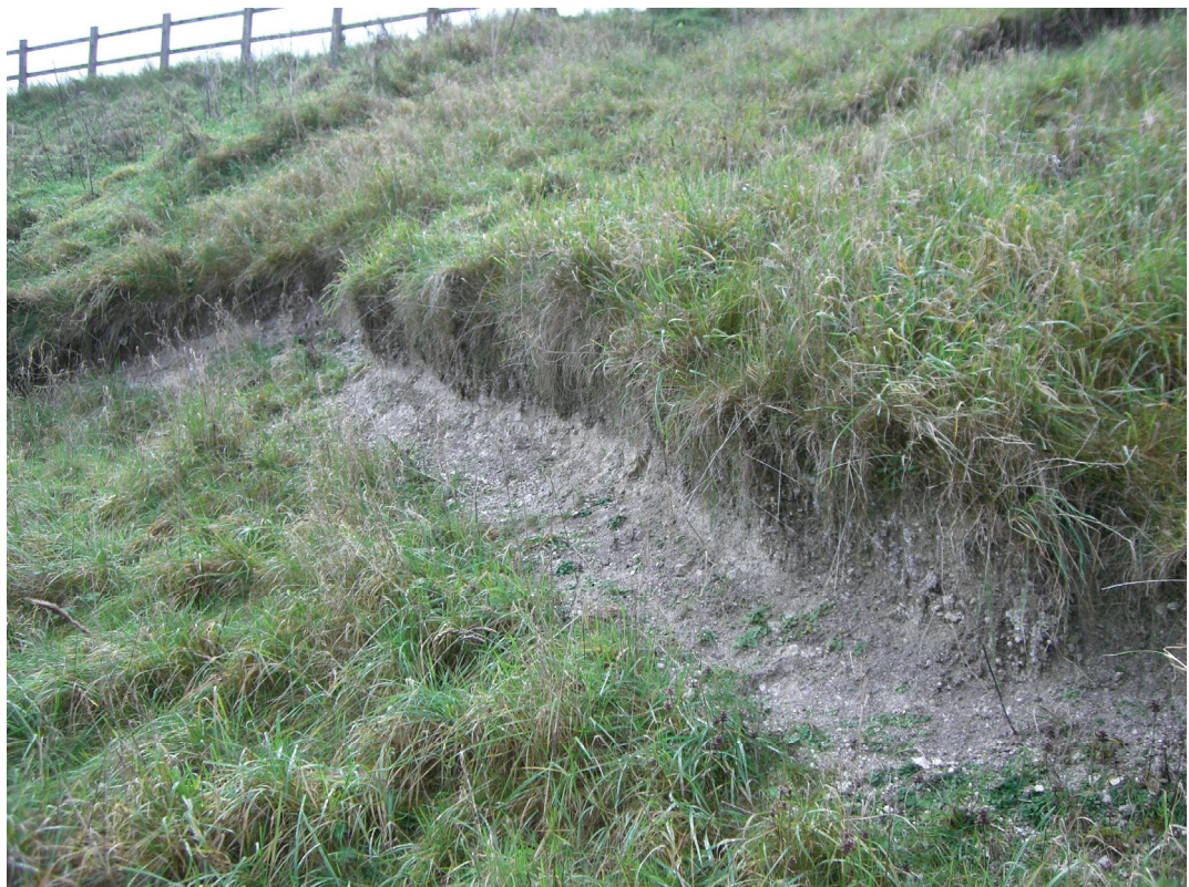
Figure 6. Silbury Hill Exposure 1 looking SE (Image CIMG0334, 20/11/06).