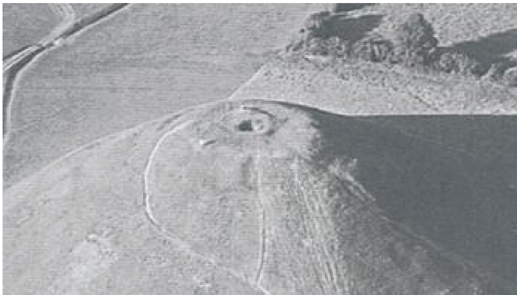
Figure 2. Aerial View of Silbury Hill in 1934 showing a hole in the top.