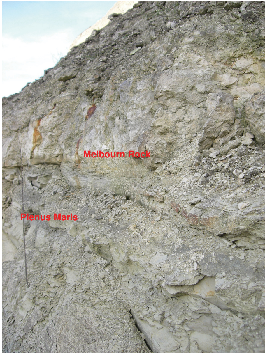
Figure 19. Beggar's Knoll Quarry looking along the quarry face from Exposure C (Image CIMG0361, 13/12/06).