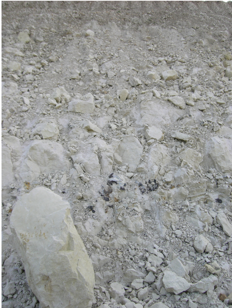
Figure 14. Beggar's Knoll Quarry Exposure A showing the New Pit Chalk Member of the Middle Chalk Formation (Image CIMG0356, 13/12/06).