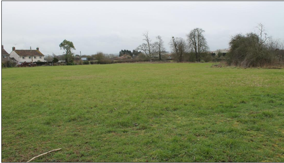
Photo 1. Western half of site, view from north