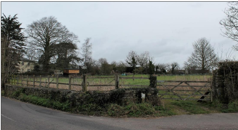
Photo 2. South-west corner of site