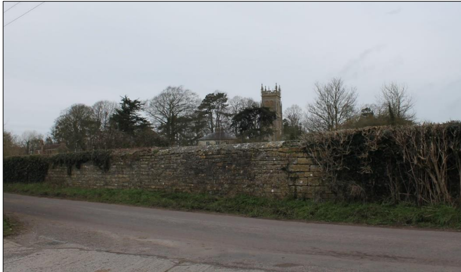
Photo 3. View north from Tanyard Lane