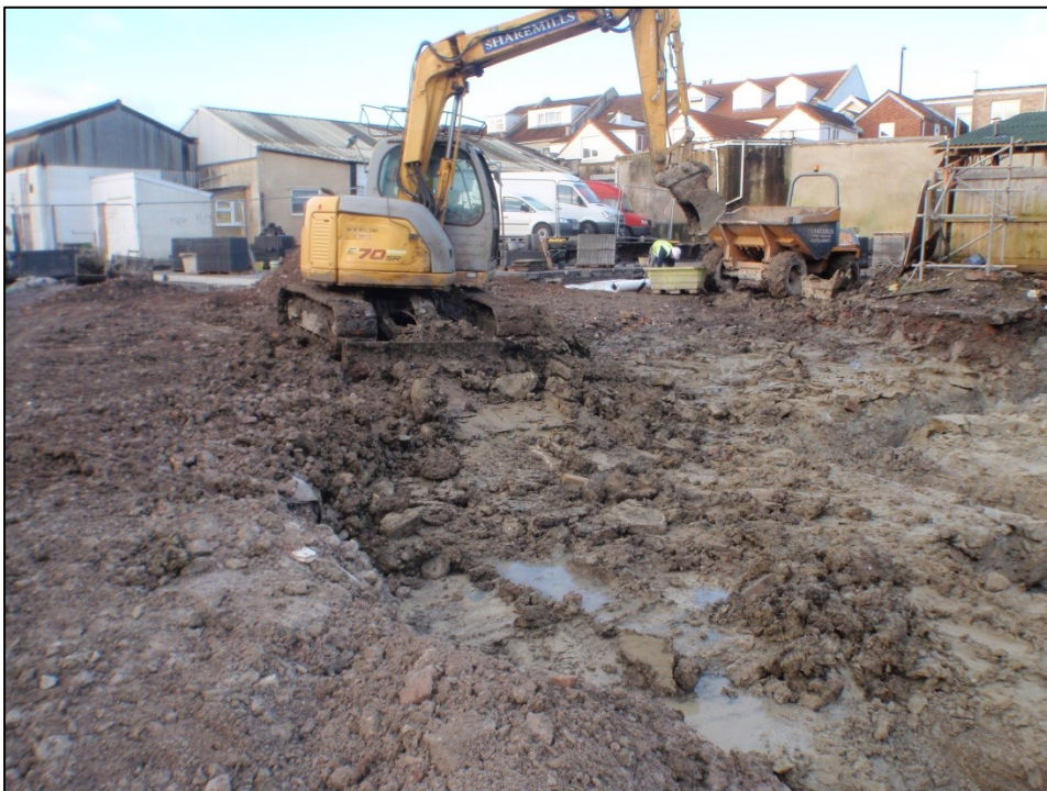
Plate 4. General view of Block C area at start of foundation excavation, looking SW.