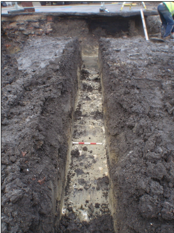
Plate 2. Foundation across Block A as excavated, looking west. Scale 0.5m.