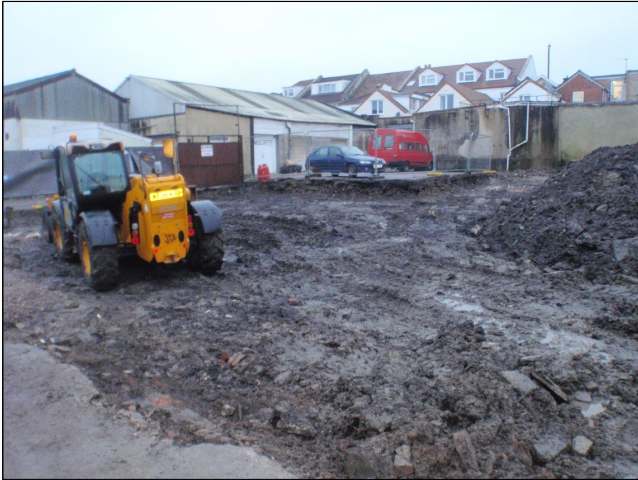
Plate 1. General view of the south half of the site at the start of monitoring, looking SW.