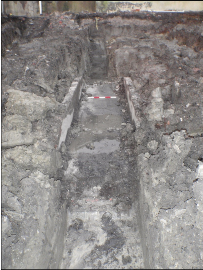
Plate 3. Former vehicle inspection pit in footings on south side of Block B, looking west. Scale 0.5m.