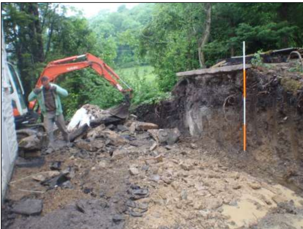
Plate 4. Reduced level platform on the east side of the property after removal of revetment walls and floor surfaces. Looking NE. Scale 2m.