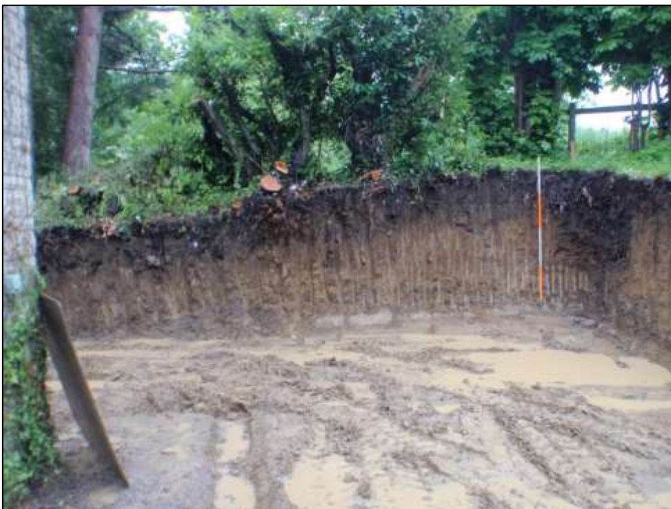
Plate 2. Section of the reduced level platform on the south side of the property at completion of excavation, with Pit Cut and Fill (104) on left. Looking E. Scale 2m.