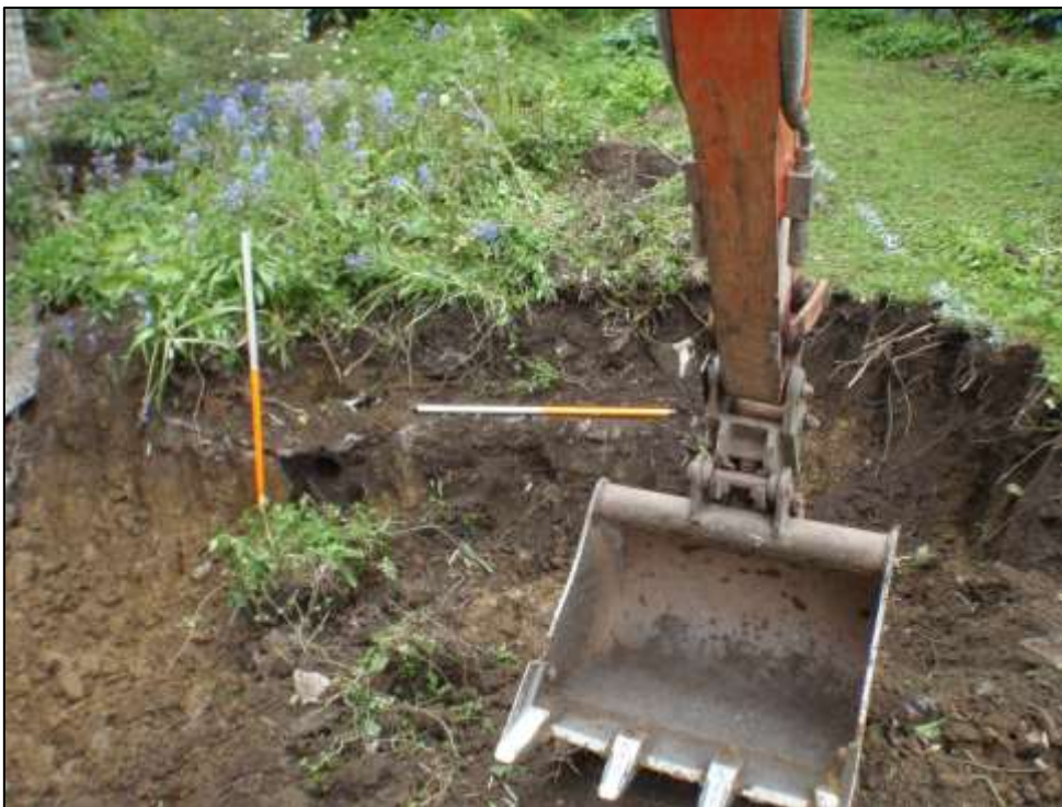
Plate 3. Concrete Surface exposed in section of excavation of the reduced level platform on the south side of the property. Looking ENE. Scale 2 x 1m.