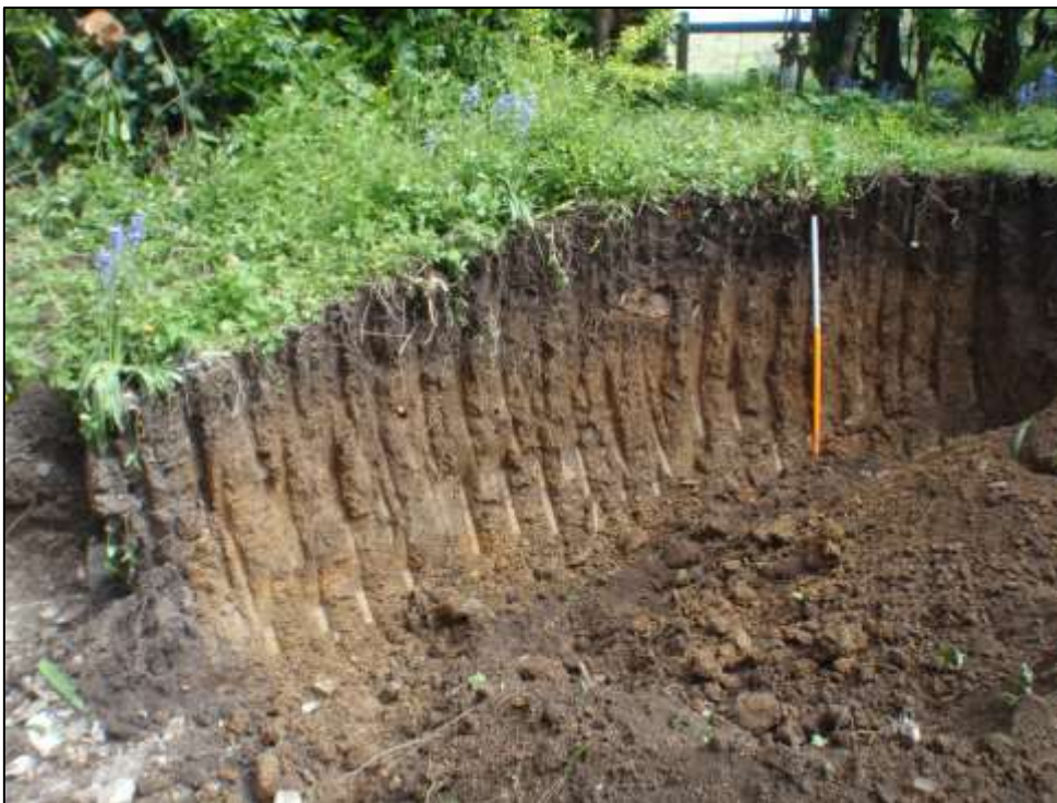
Plate 1. Section of the reduced level platform on the south side of the property during excavation, looking SE. Scale 1m.