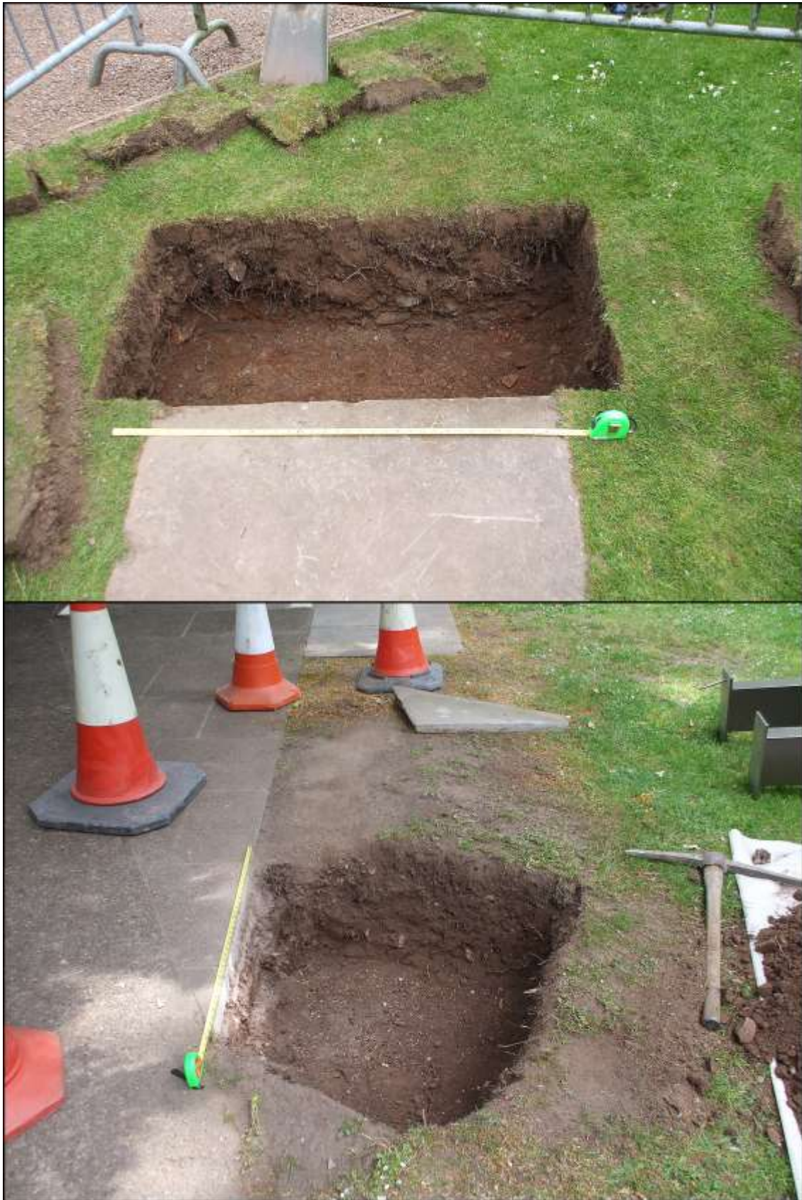
Figure 2: Post-excavation photographs of Trench 2 (top, No.4) and Trench 3 (No.10).