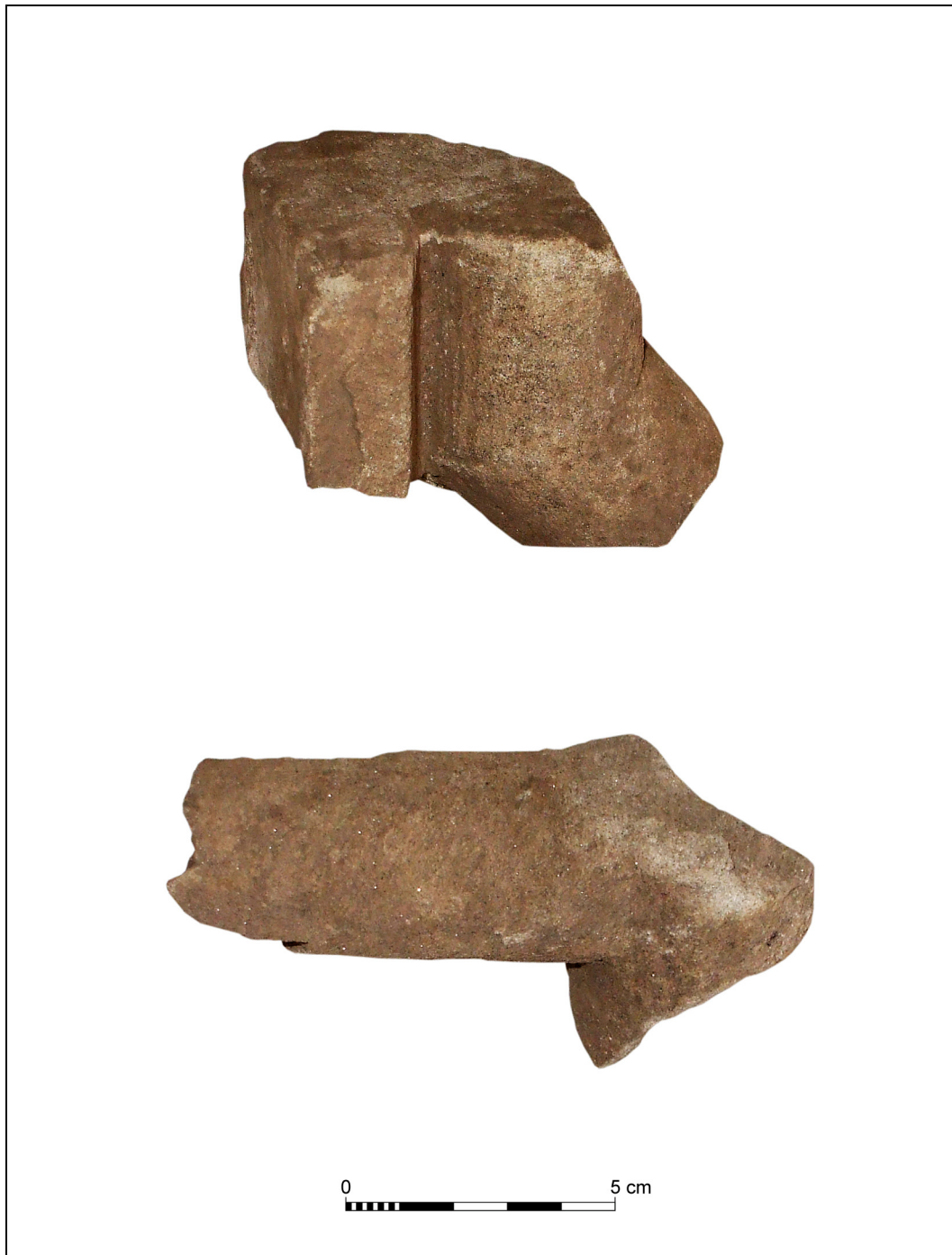
Figure 3: Small finds 001 (top) and 002, retrieved from context 003.

Contexts 003 and 004 appear to represent demolition horizons from the Abbey Church - possibly 16th century destruction and clearance works.