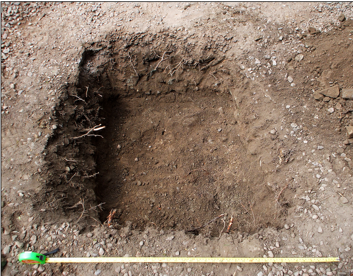
Figure 2: Post-excavation photograph of the trench (No.4, detail).

The trench was located 3.4m W of the S face of the W door, between two existing interpretation panels. The two existing panels were removed, and a new trench excavated, measuring 0.8m x 0.8m x 0.5m (LxWxD). The contents of the trench comprised 001 , elements of the modern concrete pad associated with the existing signage (0.1m thick), which lay over 002 , a dark silt and gravel layer containing early 20th century bottle glass (0.1m thick), which in turn lay over a compacted rubble deposit ( 003 ) that extended across the trench (0.15m thick), and which contained two fragments of worked stone ( SF001 and SF002 ). Context 003 sealed 004 , a heavily compacted silt deposit containing lots of mortar fragments. This was excavated to a thickness of 0.15m throughout the trench, before the required depth of the trench was reached (c.0.5m), and excavation ceased.