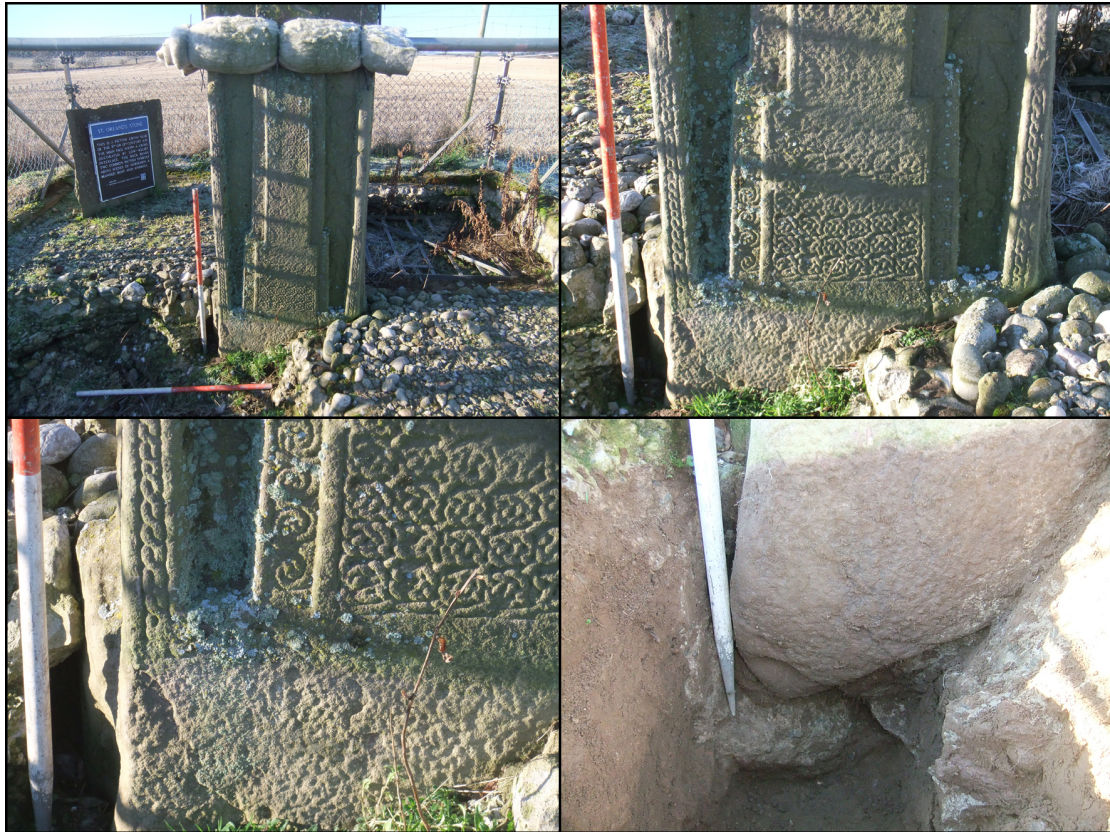
Figure 2: Views of the work in progress. Clockwise, from top-left: Photos 1, 3, 16 and 7.