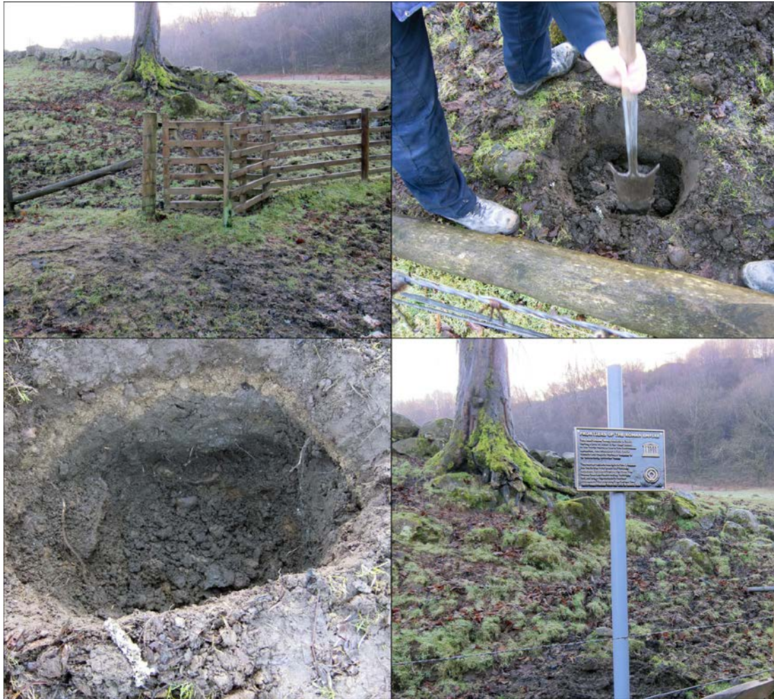
Figure 2: Clockwise from top-left: The site pre-works; Excavation of Trench 1; Trench 1 as dug; The new sign in place.