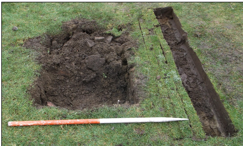
Plate 1: Trench following removal of the existing sign

The site of the present sign lay within an eroded, crudely walled enclosure on the summit of a natural, rocky, grass covered area of high ground to the SE of the castle. The hole left after removal of the sign footing plates measured 1m x 0.6m (N/S x E/W) and was up to 0.15m deep. The work necessitated the removal of only turf and topsoil.