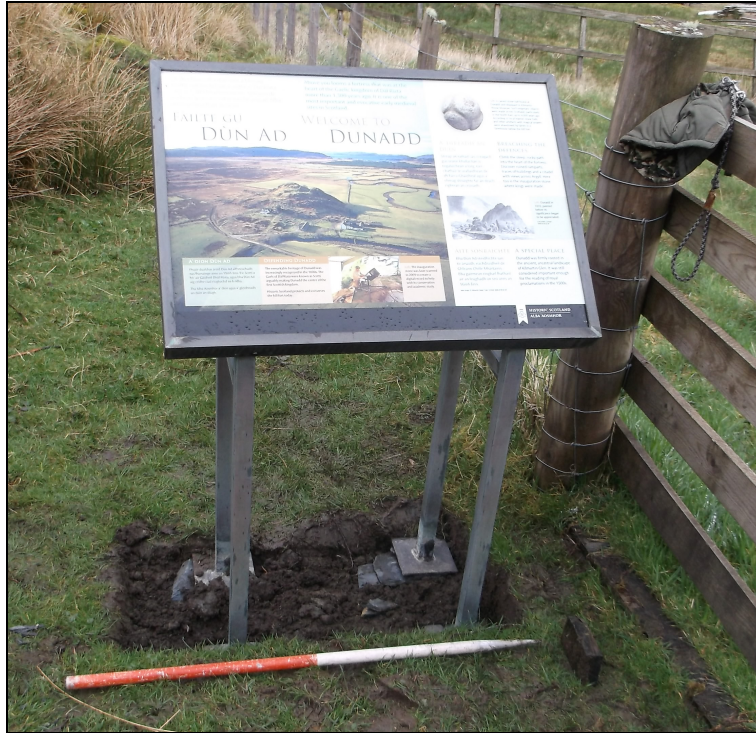
Plate 1: The new sign in situ .

A shallow trench \approx 0.15\text{m} deep was excavated through turf and topsoil, over an area 0.9\text{m} (N/S) x 0.6\text{m} (E/W). Once the trench was excavated, the sign was placed in situ and the footings concreted over.