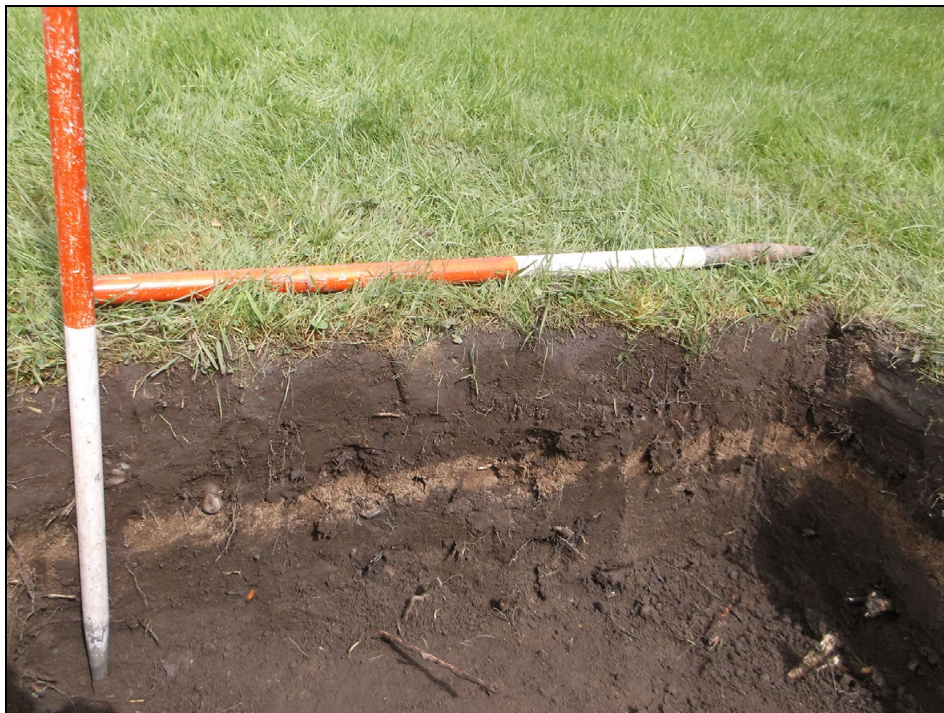
Plate 1: View of Context 003 , visible as the light-brown band running across the section