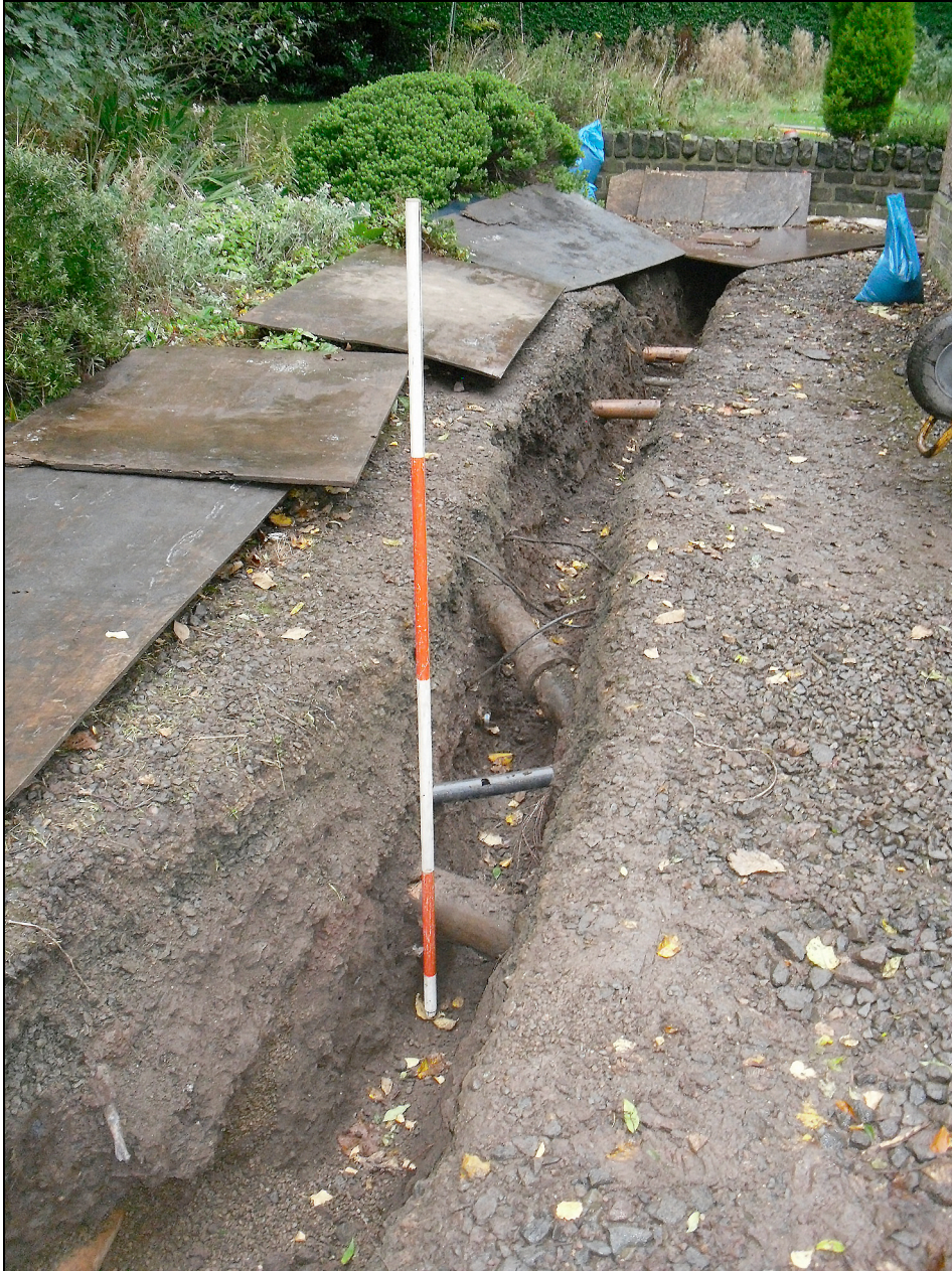
Plate 1: Eastern trench, showing pipes 002, 003, 004 in foreground, 007 and 008 in background