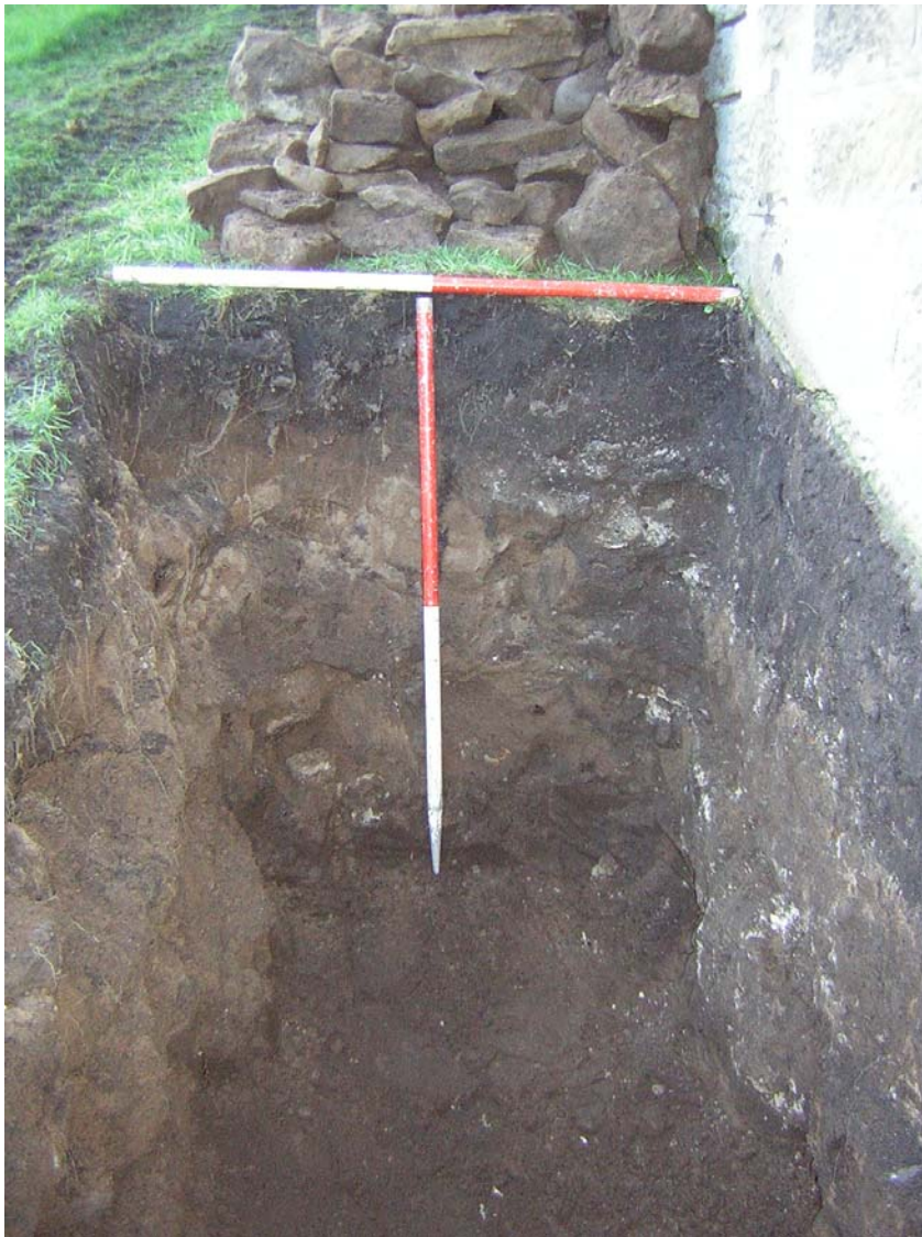
Plate 1 : W end of trench showing E facing section, taken from E