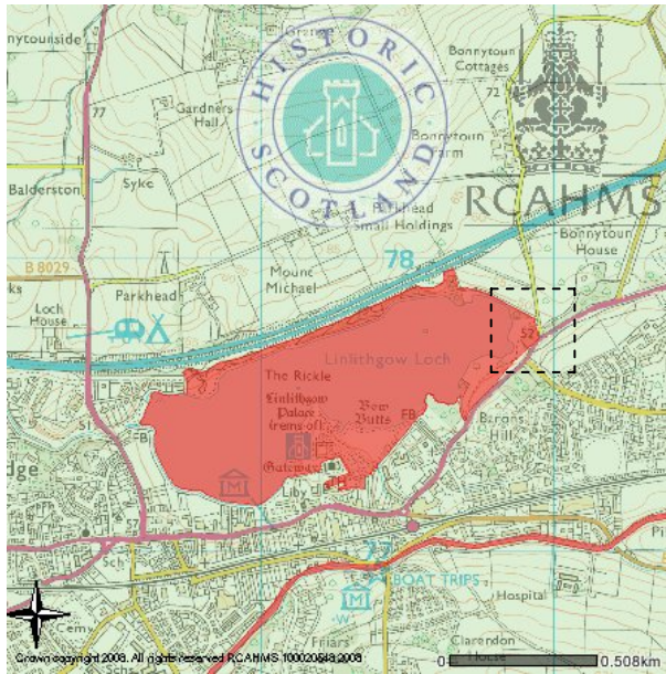
Figure 1: General Location Map