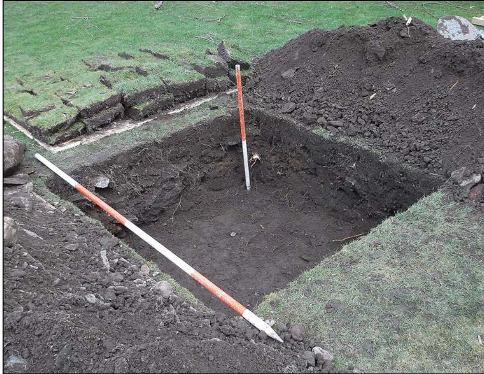
Plate 1: Post-excitation view of the trench.

Context 002 was excavated to its full depth of 0.6m; context 004 was excavated to the required final trench depth of 0.6m