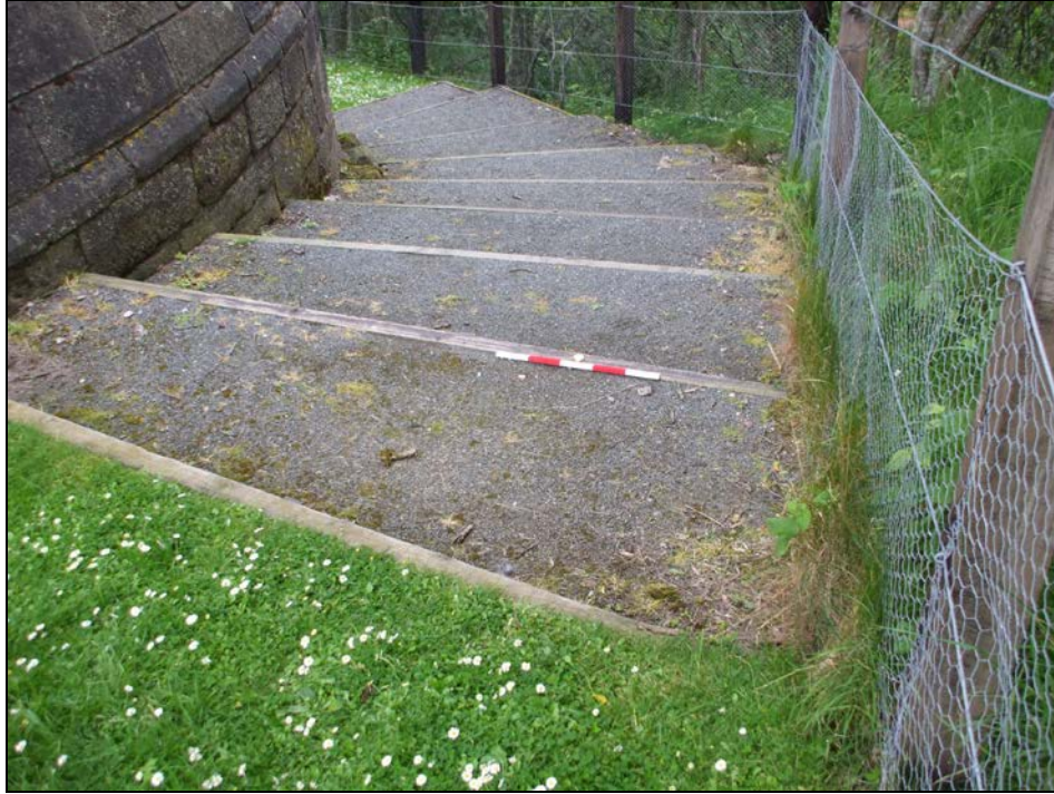
Plate 1: Location shot of PSM5.

The secondary trench (8b) was placed at the edge of the top of the inner bank of the external W ditch outside the Maule Tower. The trench measured 20cm N/S x 25cm E/W x 15cm deep. Turf and mid-brown topsoil (8003) was 15cm deep and overlay a layer of moderately-compact mid-brown silty clay (8004).