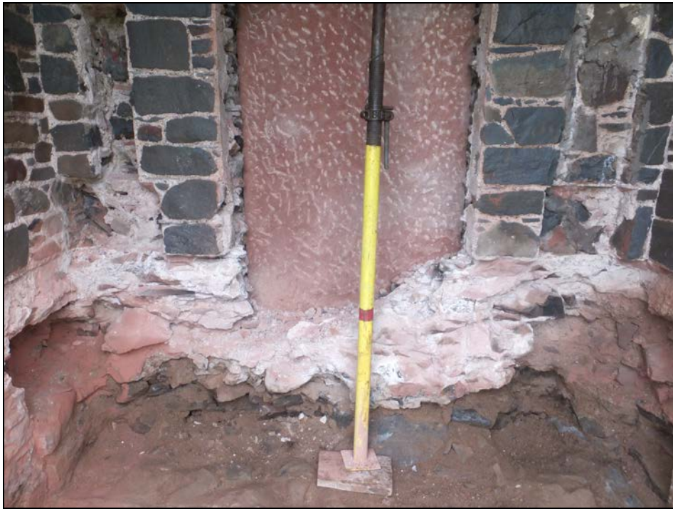
Plate 1: The excavation as finished, from the W

A large slab of red sandstone was visible on the W side of the porch, evidently a slab which faced into the church (003). Access was not possible to inspect the front face of this stone.