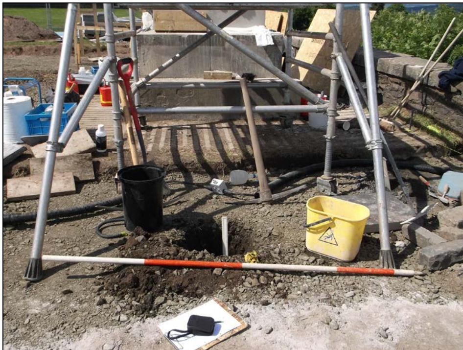
Plate 1: View of Trench 1 during excavation.

The centre point of the trench was located \approx 2.3m from the S face of the statue plinth. The upper fill comprised loose, imported stone chippings ( 001 ) over an imported dump of reddish coloured clay rich silt and stones ( 002 ) up to 100mm deep. Asbestos was found immediately below 002 , as part of the fill of a spread of dark grey silt and stones ( 003 ) which was reburied following consultation with Historic Scotland staff.