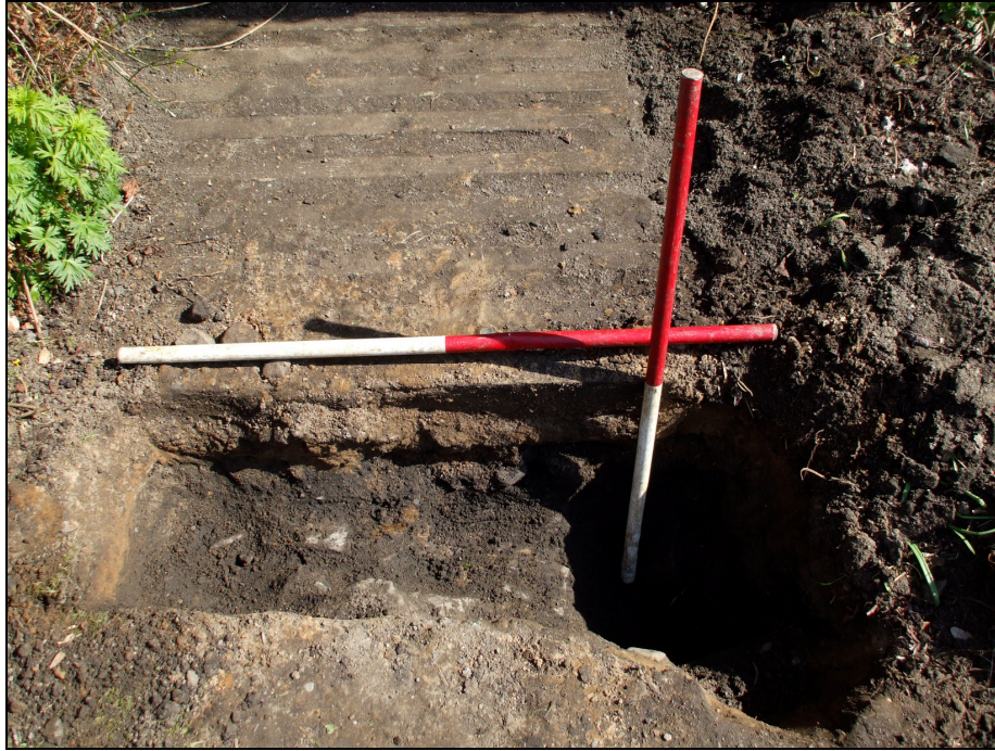
Figure 3: Post- excavation shot of W-facing section in Trench 1

demonstrated that the pipe drained into a soakaway, although this was not exposed during the work.