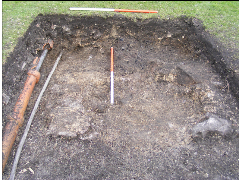
Figure 2: N end of the trench following excavation.