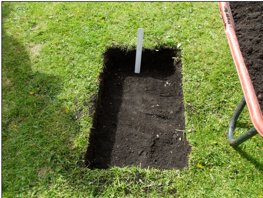
Figure 3: W-facing section of Trench 3 for INX9.

Trench 3 was located in the grassed area W of the abbey's latrine. The trench housed sign INX9 (see Figure 1).