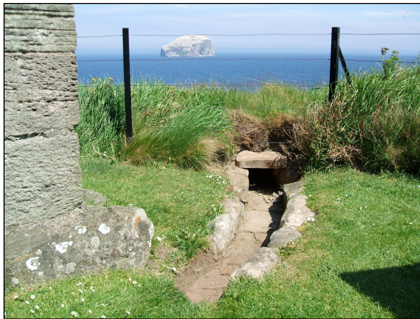
Figure 3: The stone drain near the Brew House.

While on site, Kirkdale Archaeology was notified that a linear stone feature located on the NE side of the castle courtyard had recently been weeded and tidied by a castle custodian. The feature ran NE/SW and was located almost parallel to the remains of the old brewery. It consisted of two courses of roughly worked stone blocks, each of which was sitting either side of some stone slabs beneath. At the NE end of this linear feature a stone lintel covered the structure as it ran underneath overgrown grass and possibly out to the cliff face. At the SW end, the feature was still covered by grass, so its full extents could not be determined. From what was visible, it appeared to be c.2m long. This feature was possibly a stone drain, which perhaps ran from the old brewery into the sea.