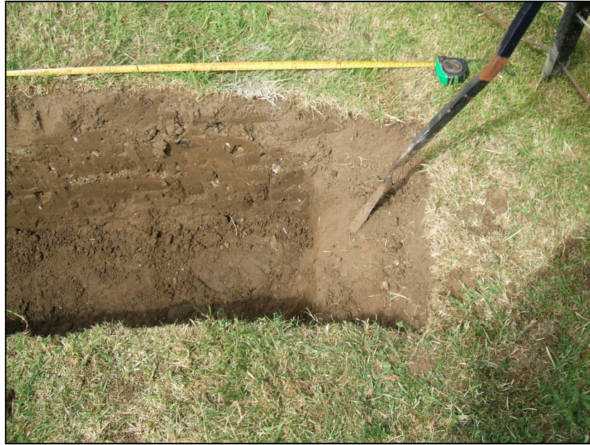
Figure 2: The concrete and inset metal post at the N end of the trench.

One small piece of modern white glaze pottery was retrieved from (002), again indicating the recent disturbance or origins of this context. No other artefacts were found.