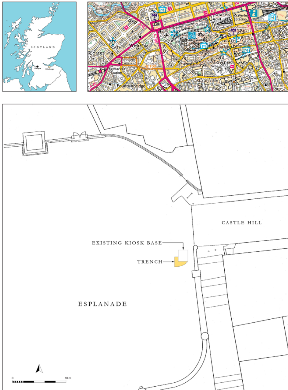
Figure 1: Plan showing the general location of the trench.

Under the terms of its PIC call-off contract with Historic Scotland, Kirkdale Archaeology was asked to carry out an archaeological watching brief during the excavation of the footprint for a new ticket kiosk at the eastern end of the esplanade in front of Edinburgh Castle (Fig. 1). The present kiosk sits on a concrete base which was to be incorporated as part of the new layout, with a curving extension to be excavated to the south-west.