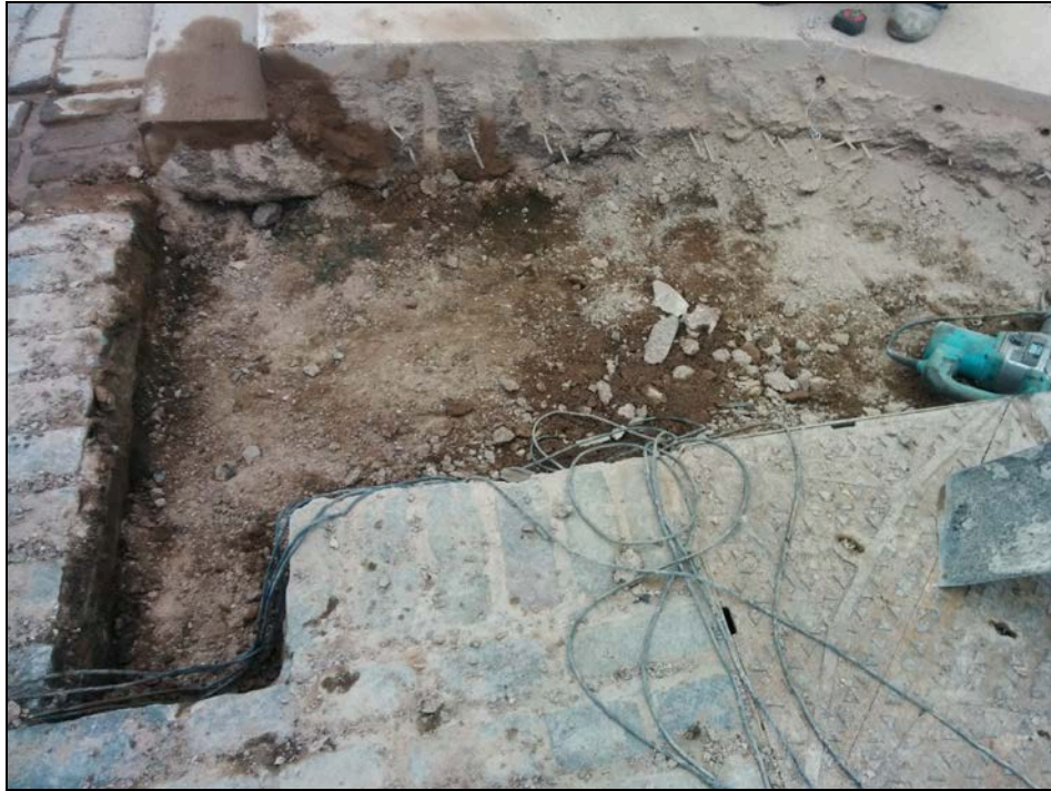
Plate 1: Post-excitation view of the trench, viewed from the west.