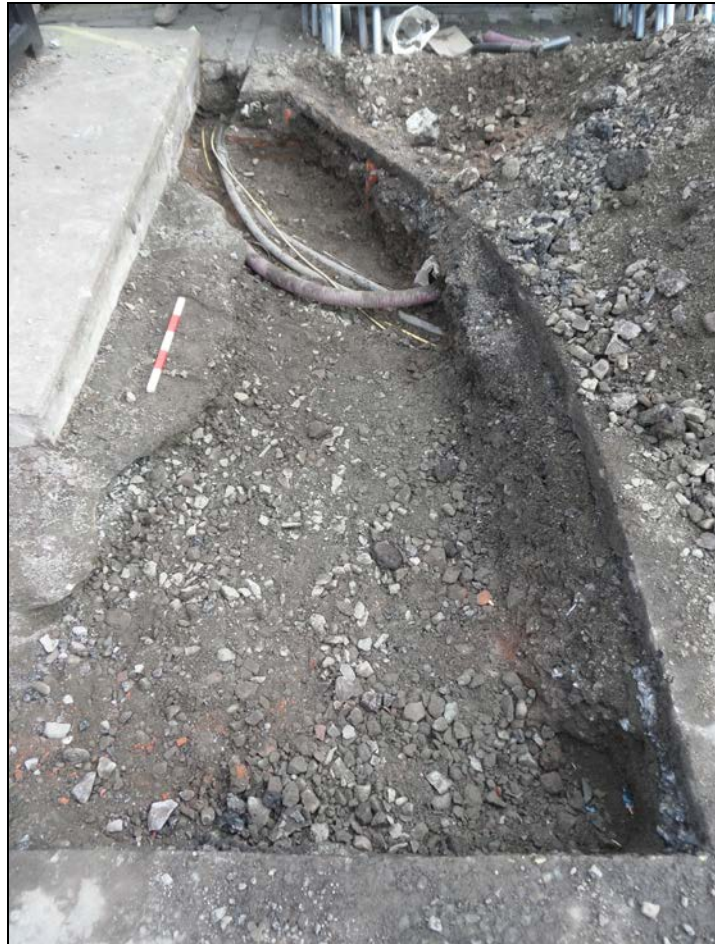
Plate 1: Post-excitation view of the trench, viewed from the west.

The setts were removed and the extended footprint was cut with a circular saw. A hydraulic breaker was then used to remove the tarmacadam. The tarmacadam was 0.07m – 0.12m thick and sat on a layer of mid-brown granular bedding 104 . At a depth of \approx 0.20m, a concrete sub-base 101 was attached to the existing concrete kiosk base. This was backfilled to the west by a solid layer of 'type 2' stone 102 . The concrete sub-base had been cut ( 103 ) to the east in order to insert various electrical cables 105 . These ran past a projecting red brick service box 106 . It was decided to reuse the concrete sub-base 101 and type 2 stone 102 as part of the new extended kiosk base.