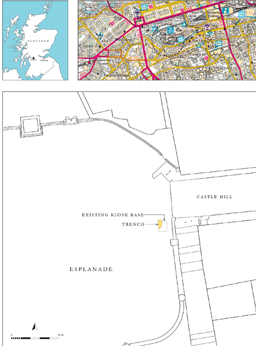
Figure 1: Plan showing the general location of the trench.

Under the terms of its PIC call-off contract with Historic Scotland, Kirkdale Archaeology was asked to carry out an archaeological watching brief during the excavation of the footprint for a new ticket kiosk at the eastern end of the esplanade in front of Edinburgh Castle (Fig. 1).