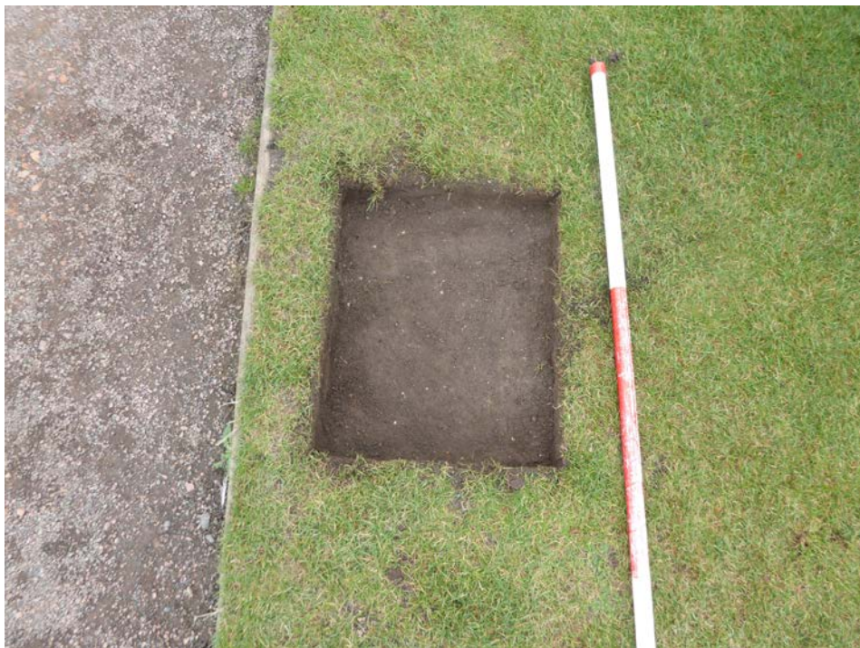
Plate 3: Trench 3, as finished.

Trench 3 was opened up on the south side of the path running around the northern end of the cathedral. It was aligned parallel to this path (approximately NW/SE) and was located opposite a gate through the north side of the cemetery wall, just north of the east end of the cathedral. The trench measured 54cm NW/SE x 43cm NE/SW. A similar sequence of 8cm of fine light brown silt 300 was removed to expose a similar soil, 301 , flecked with mortar.