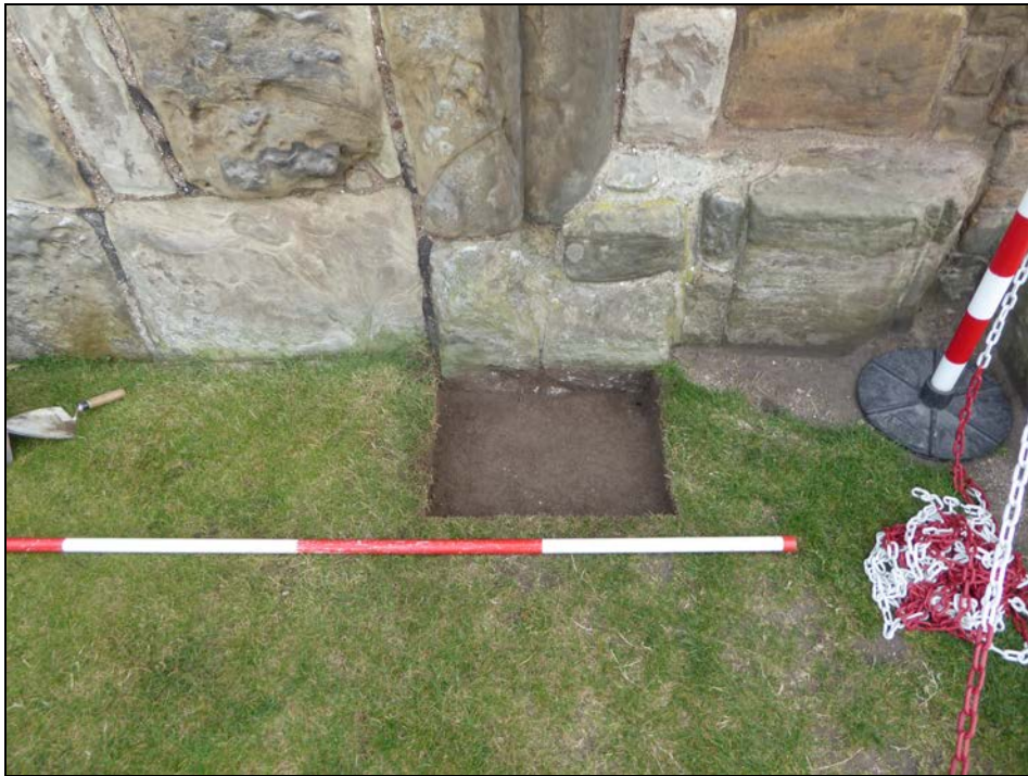
Plate 1: Trench 1, as finished.

The trench was located to the north of the extant door, at the base of the northern of the two roll mouldings. It measured 54cm N/S by 43cm E/W and reached a maximum depth of 8cm. the topsoil 100 proved to be a very fine light brown silt, while at the base of the trench 101 was a similar soil matrix, but with flecks of mortar throughout.