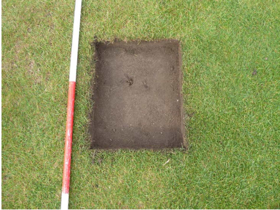
Plate 2: Trench 2, as finished.

Trench 3 was opened up on the south side of the path running around the northern end of the cathedral. It was aligned parallel to this path (approximately NW/SE) and was located opposite a gate through the north side of the cemetery wall, just north of the east end of the cathedral. The trench measured 54cm NW/SE x 43cm NE/SW. A similar sequence of 8cm of fine light brown silt 300 was removed to expose a similar soil, 301 , flecked with mortar.