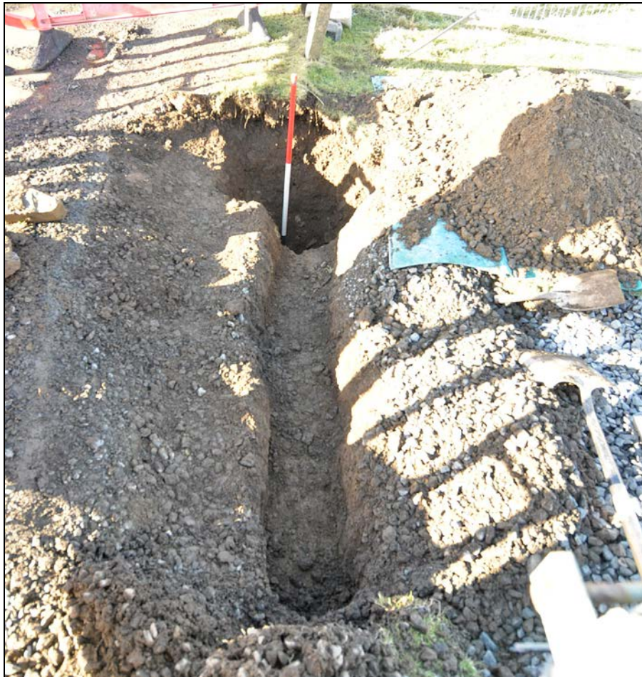
Plate 1: Trench 1, post-excitation.

This was located towards the southern corner of the field, just north-west of the livestock gate where the extant visitor access 'kissing gate' and nearby strainer post were to be removed. All the material removed was either part of the concrete foundation of the existing strainer post and gate, or material previously disturbed and re-deposited. The area excavated measured \approx 2.5\text{m} NW/SE by 1.2\text{m} NE/SW. In general the trench was excavated to a depth of 0.1\text{m} onto a clear gravel surface. Within this a \approx 0.50\text{m} wide and 0.35\text{m} deep channel was dug, with a deeper, wider area at its north-western end, \approx 0.8\text{m} wide with a maximum depth of 0.8\text{m} . The latter area did not extend beyond the trench created by the concrete foundations of the removed strainer post, and as such, no undisturbed material was affected.