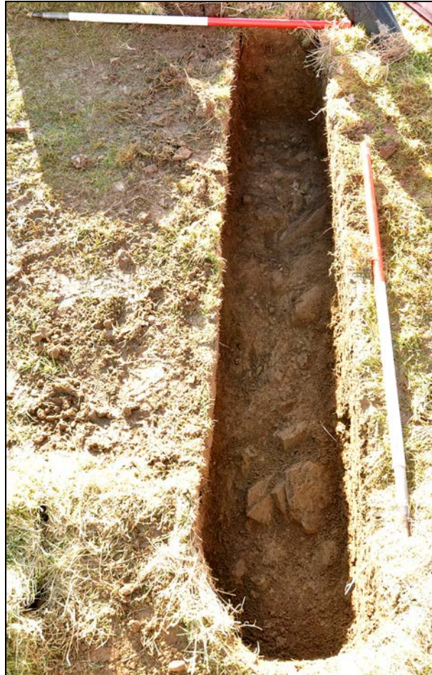
Plate 2: Trench 2, post-excitation.

Trench 2 was located at the far northern corner of the field, where a stile over the fence giving access to the path to Barnhouse Village was to be replaced with a gate. An exploratory 'prod' of the turf with a spade revealed a lot of stone near the surface, in the originally intended location, so the area excavated was moved a little to the south-west where no stone was detected. A trench measuring 2.15m NE/SW was opened, with a width of 0.3m NW/SE. The removal of 0.1m of turf and topsoil, 201 , revealed 202 , a fairly compact layer of mid-to-dark greyish brown, silty, clay, 0.15m – 0.18m thick, with occasional small, angular, sandstone fragments. Beneath this was 203 , a 0.15m – 0.18m thick layer of material almost identical in composition to 202 , although a little lighter in colour, slightly stonier and with a few charcoal flecks. The boundary between 202 and 203 was not clearly defined. The removal of 203 revealed 204 , a compact, grey-brown clay with abundant large, angular stone fragments. The surface of this deposit was encountered at a maximum depth of 0.45m.