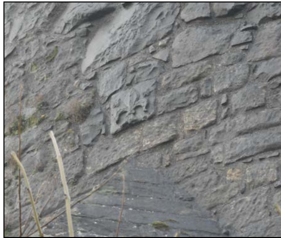
Plate 2: The armorial on the eastern corner of the French Spur.

It was noted during the works that the French Spur carries an armorial on its external eastern corner, just above the lower buttressing. The stone is broken in its lower portion (possibly due to the insertion of the buttress). The armorial consists of a central fleur-de-lis flanked in its upper portion by two cinquefoils (flowers with five petals). It could be that this is a conjoining of the fleur-de-lis of Mary of Guise with the two upper and single lower (now missing) cinquefoils of the Hamiltons. Mary of Guise's master of works from 1543 – 79 was John Hamilton of Millburn, and he would have been responsible for the construction of the French Spur.