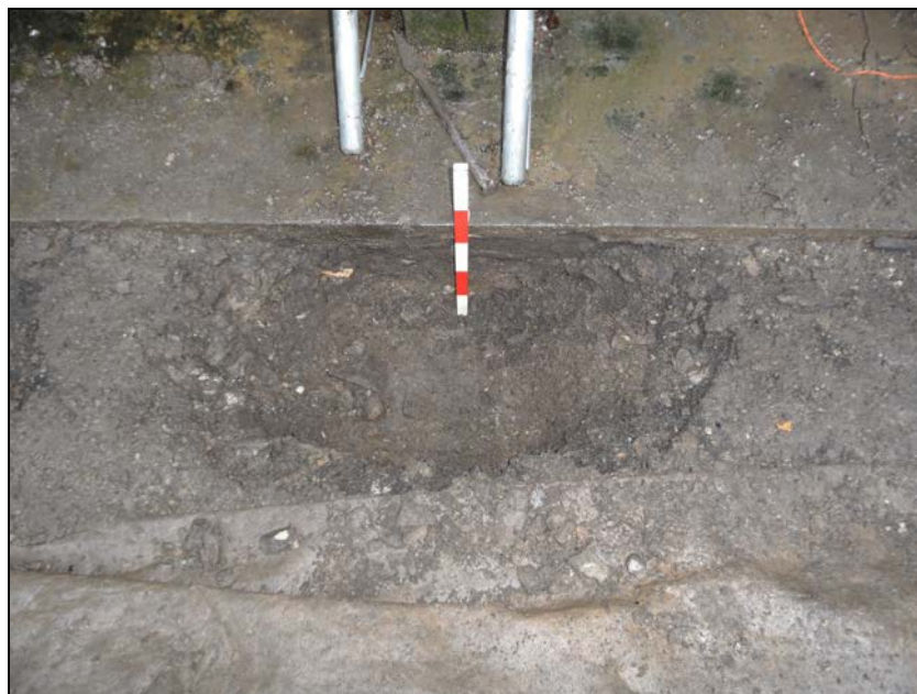
Plate 2: Post-excavation view of the central part of the trench (contexts 102, 103, 104 and 105).

Nothing of particular interest was found during these works although the required depth of excavation was minimal. The area is interesting as there are at least two clearly defined periods of building and remodelling, and it is clear that later remedial works have also been carried out. As the area is defined as being of high archaeological potential, it is recommended that future works be similarly accompanied by an archaeological watching brief.