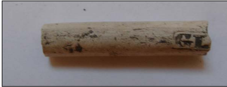
Plate 1: 19 th century pipe stamped with 'GL' (for Glasgow) found in layer 103.

To the north, the thin \approx 8 cm high stone slabs 104 were bedded on a rubble base 105 , \approx 12 cm high. All of the slabs were bedded on material which yielded 19 th century artefacts. It is likely that the gravel floor and slabbed bed of the recess must therefore have been remodelled or re-laid in the 19 th century.