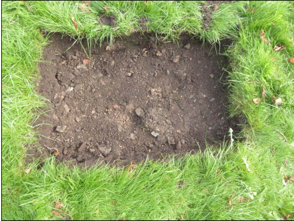
Plate 1: Post-excavation view of the trench.