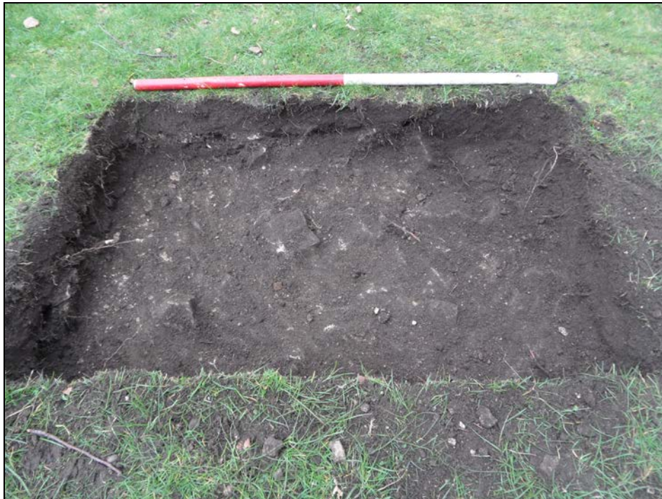
Plate 1: Trench 1 showing mortar and stone surface 102 below the turf and topsoil.

Trench 1 (to house sign CRK02) was excavated on a relatively flat area to the north-west of the stone tower. The area then falls away via a steep sloping bank to the north-west, north and north-east. The trench measured 1m NE/SW x 0.7m NW/SE. The turf and mid-brown silty topsoil 101 containing numerous sub-rounded and sub-angular stones and some modern artefacts was removed to a depth of 100 – 180mm across the trench. This exposed a surface of compacted stone and mortar 102 which had to be considered an archaeological horizon and therefore a stopping point. Though the preferred depth of the trenches for the new signage was 450mm, comprising a 300mm concrete foundation plus 150mm for bedding material, following consultation with the HES Cultural Resources team, it was decided to use the excavated depth to emplace the sign rather than risk disturbing in situ archaeological deposits.