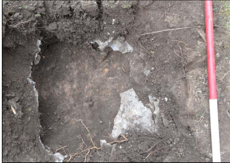
Plate 4: Showing the re-deposited clay forming the inner ditch scarp (truncated by CRK01).

The sign was removed and was shown to have a thick concrete base. This was removed and the hole created was to be backfilled with topsoil and turf from Trenches 1 and 2. The hole measured 0.60m x 0.60m x (up to) 0.20m deep. It was noted that the foundation for this sign had partially truncated part of the upraised fabric of the inner ditch scarp, which like 202 (encountered in Trench 2) was made of re-deposited clay flecked with charcoal (Plate 4).