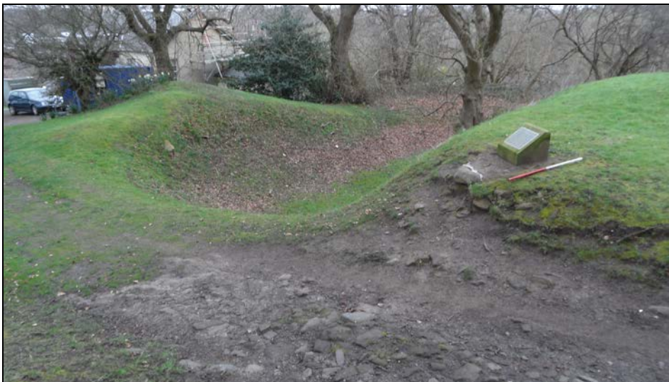
Plate 3: Showing the existing position of sign CRK01.

The existing stone plinth sign was located on the opposite ditch bank to the east (Plate 3). This was removed under an archaeological watching brief although the subsequent hole created was not formalised in to a trench.