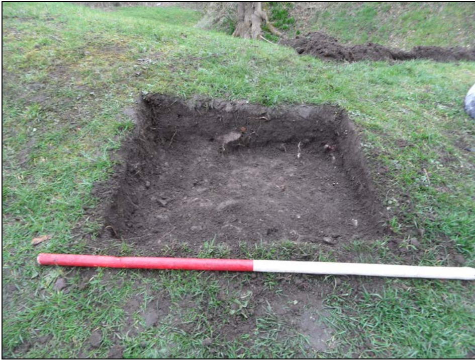
Plate 2: Trench 2 showing re-deposited clay bank 202 below the turf and topsoil.

it was decided to use this excavated depth to emplace the sign rather than risk disturbing in situ archaeological deposits.