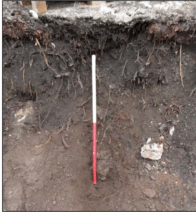
Plate 3: E-facing section on the south side of the wall.

Having prepared the ground, the removal of the existing wall foundation proceeded. Soil to a depth of 0.30m was to be added to each side (north and south) of the existing wall (0.65m wide) to form a trench 1.25m wide E/W x 0.60m deep. This was again removed using a mechanical digger. The wall foundation was laid to the north so that the stone could be cleaned and reclaimed while the soft deposits were stored in a bund to the south.