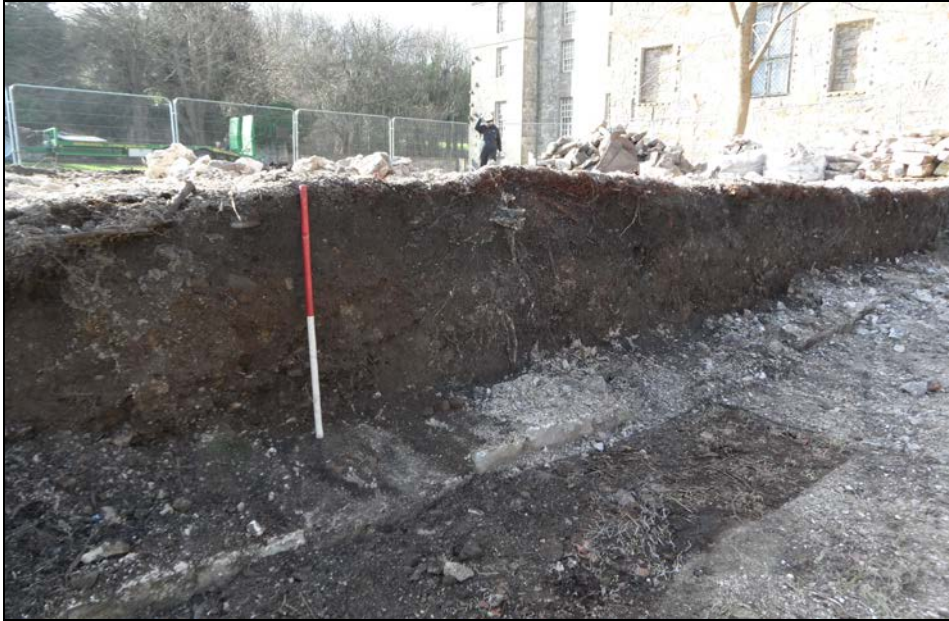
Plate 1: The pre-excavation sequence of banked deposits and reduced wall line.

In order to achieve this, the mechanical digger had to reduce an area 1.75m wide N/S x 1m deep. A further 1m wide (N/S) strip was then battered up to the existing level of the upper terrace (Plate 2). In this way enough operating room was created to allow the excavation of the new foundation trench.