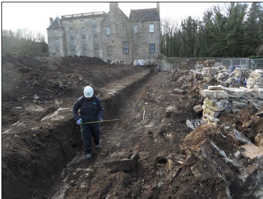
Plate 4: Post-excitation shot showing the new foundation trench.

Having prepared the ground, the removal of the existing wall foundation proceeded. Soil to a depth of 0.30m was to be added to each side (north and south) of the existing wall (0.65m wide) to form a trench 1.25m wide E/W x 0.60m deep. This was again removed using a mechanical digger. The wall foundation was laid to the north so that the stone could be cleaned and reclaimed while the soft deposits were stored in a bund to the south.