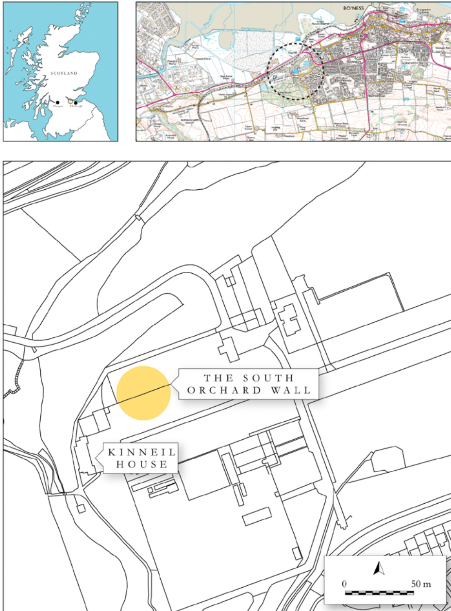
Figure 1: Plan showing the general location of the south orchard wall under investigation.

Under the terms of its PIC call-off contract with Historic Scotland, Kirkdale Archaeology was asked to carry out an archaeological watching brief at Kinneil House near Bo'ness in West Lothian (Fig. 1). This followed an initial stage of test trenching in April 2016 1 of the south orchard wall which was leaning considerably to the north, rendering it potentially dangerous and the subject of a programme of repair. The April 2016 work identified the below ground position of the wall foundation. This was followed by a considerable period of down-taking of the wall masonry until it lay flush with the ground level of the orchard.