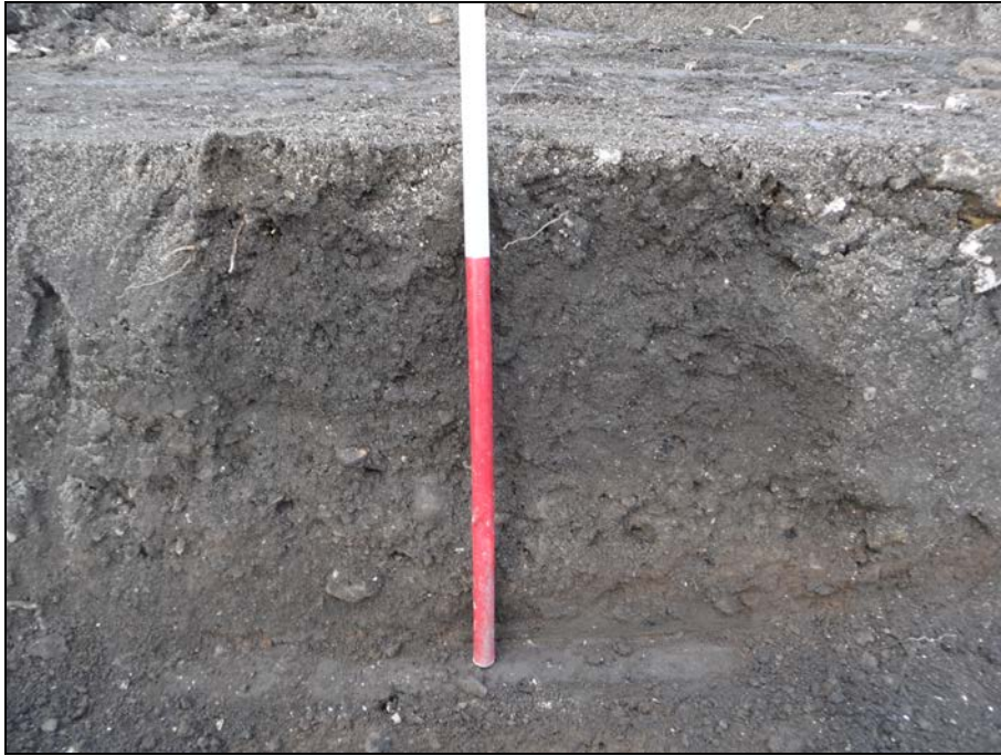
Plate 5: Post-excavation shot showing the S-facing deposits forming the ground of the orchard.

The deposits of the orchard again showed a basic sequence of imported garden soil 101 , c.0.50m thick overlying a layer of imported charcoal-flecked brown clay 102 . As 102 appeared to form the same deposit to north and south of the wall, this suggests that they were emplaced at the same time i.e. in the late-17th century.