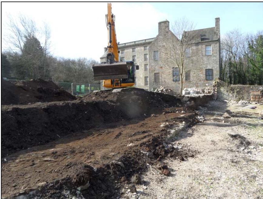
Plate 2: The working platform being excavated by the digger.

In order to achieve this, the mechanical digger had to reduce an area 1.75m wide N/S x 1m deep. A further 1m wide (N/S) strip was then battered up to the existing level of the upper terrace (Plate 2). In this way enough operating room was created to allow the excavation of the new foundation trench.