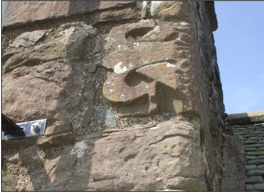
Figure 4: The carved stone (close-up)