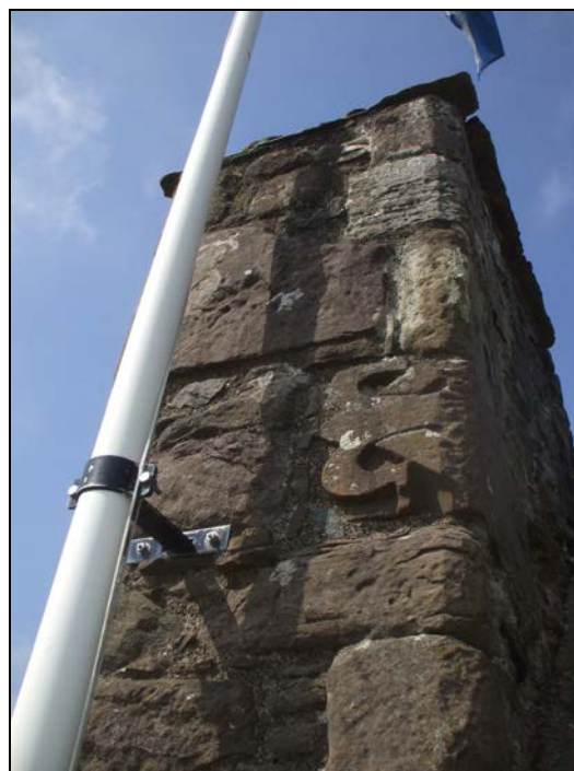
Figure 3: The carved stone

A previously unrecognised carved, re-used stone, was noted on the E side of the S chimney of the entrance tower (Figs. 3 and 4). The design bore certain similarities to the fleur-de-lis decoration on the 16 th Century plasterwork within the tower house, but was not identical. The sandstone block on which it sat was a substantial piece of masonry, and it is therefore unlikely to be part of an armorial, and was originally probably part of a larger decorative scheme. Tool marks were visible on the NE corner, where the design had been clawed-back.