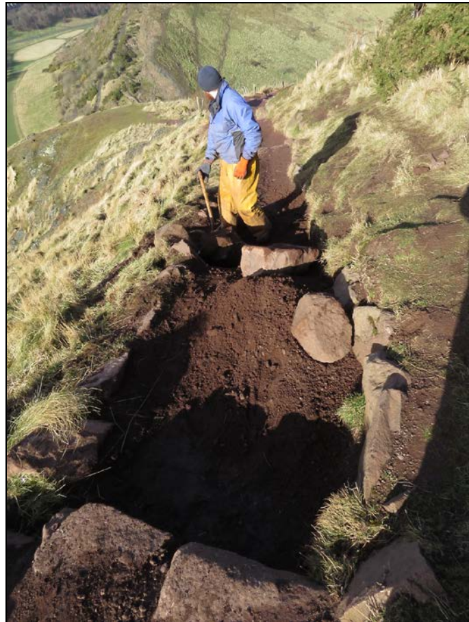
Plate 1: Area 10, work in progress.

The work involved the removal of old stones and the straightening and supporting of the path edge to the south-west. The area across which the work took place was c. 100m in length by c. 1m - 2m wide.