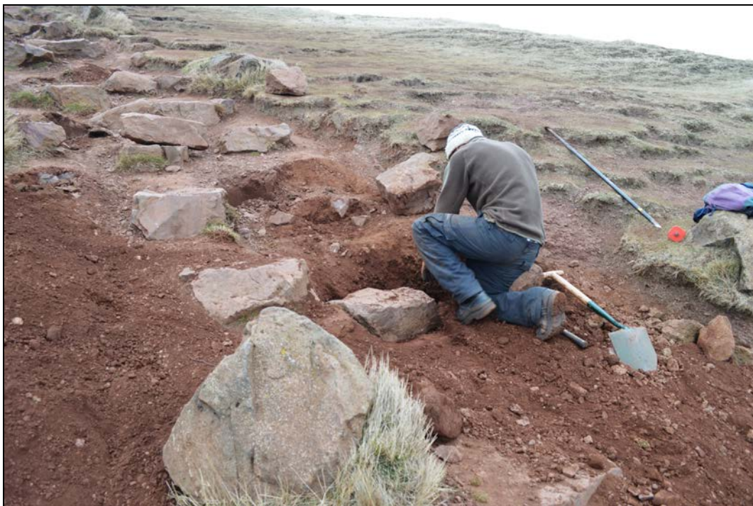
Plate 2: Area 11, work in progress.

The work in Area 11 saw the repair of old water bars, and the installation of new water bars and steps. Work was also undertaken to prevent further erosion to the path through edge remodeling and localized landscaping around the path.