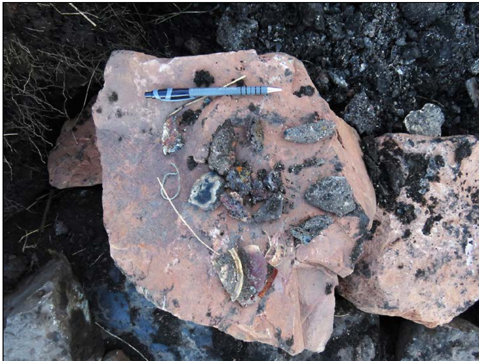
Plate 3: The finds from context 12002.

The work was undertaken along various sections of the public footpath to the south and west of St. Anthony's Chapel. It included stabilizing the soil adjacent to the path through re-grassing and bush-planting, as well as improvements directly to the path itself: lessening the gradient of its steps, improvements to drainage, creation/improvement of steps, placing new stones along the path edges and top dressing.