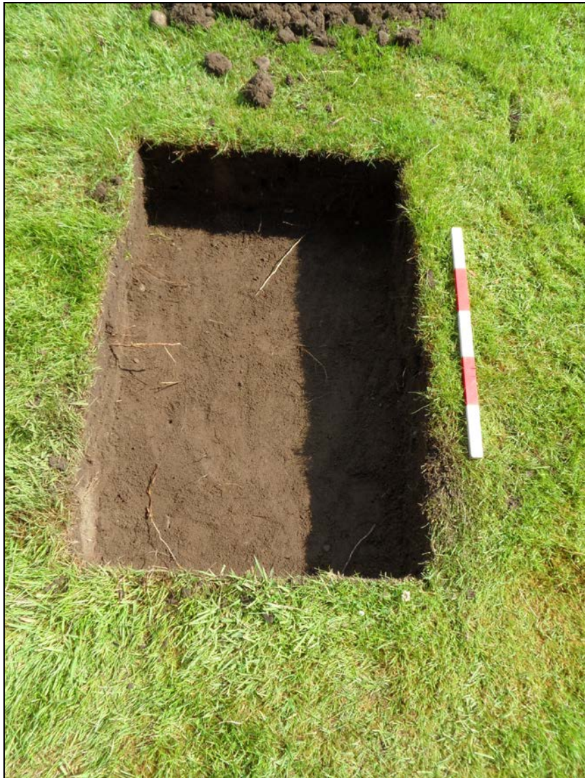
Plate 1: Post-excavation view of Trench 1.

Trench 1 measured 0.9m SW/NE x 0.6m NW/SE x 0.25m deep. The turf and topsoil 101 was \approx 9cm deep and overlay a modern levelling layer of sandy silt 102 with numerous small water-rolled pebbles ( < 10cm). This layer contained modern glass and pottery, pieces of roof slate and an iron nail. Layer 102 was partially excavated to a depth of \approx 16cm. Nothing of archaeological interest was uncovered.