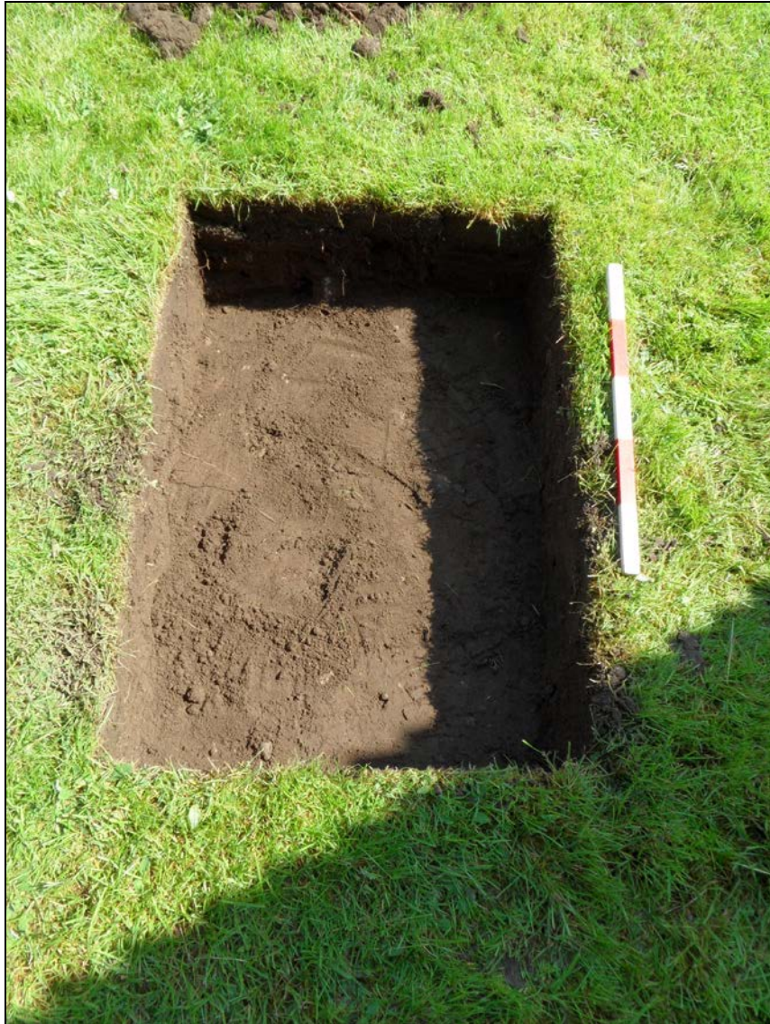
Plate 2: Post-excavation view of Trench 2.

Trench 2 measured 0.9m SW/NE x 0.6m NW/SE x 0.25m deep. The turf and topsoil 201 was c.9cm deep and overlay a modern levelling layer of sandy silt 202 containing numerous small water-rolled pebbles (<10cm). This layer contained modern glass, pottery and pieces of roof slate. Layer 202 was partially excavated to a depth of c.16cm. Nothing of archaeological interest was uncovered.