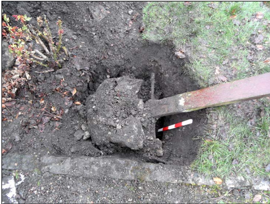
Plate 1: The existing pole sign at the Trench 1 location during removal.

The sign intended for Trench 1 would replace an existing pole sign on the north side of the path at the entrance gate to the church yard. The existing sign was partially excavated then 'rocked' out as it had a sizeable concrete base. The resultant trench measured 0.6m N/S x 0.8m E/W x 0.6m deep. Its south-western edge was located 2m east of the north side of the main entrance gate on the north side of the main path to the church. The turf 101 was 13cm deep and overlay a layer of mid-brown silty garden soil 102 flecked with charcoal. The trench was levelled with excavated soil to provide the required depth of 0.25m.