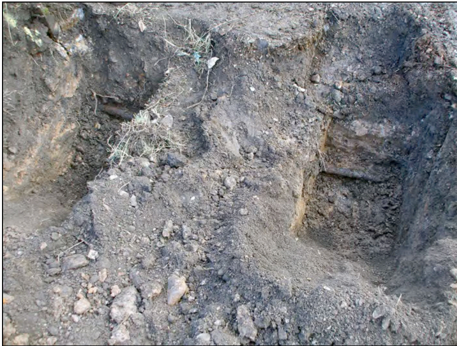
Plate 1: Trench 1, post-excavation shot

The existing gate was removed and an area 2.15m N/S x (up to) 2.9m E/W was reduced by 0.1m to the E, and graded gently up to the W. Two gatepost trenches were then excavated. The N gatepost trench measured 0.6m N/S x 0.95m E/W x 0.7m deep. The S gatepost trench measured 0.7m N/S x 0.9m E/W x 0.7m deep. The sections consisted of introduced topsoil 101 , 0.25m thick, overlying a compact gravelly surface 102 , 0.15m thick, possibly representing a hard surfacing related to the access road for the Clackmannan Water Works (now demolished). This overlay the mottled orange-brown clay natural 103 containing some small sub-rounded stones. Layers 102 and 103 had been truncated to the E by a sloping cut 104 , at least 0.25m wide, within which was a 0.05m diameter metal water pipe 105 , at a depth of 0.7m. The pipe trench had been backfilled with 106 , a re-deposited mixture of layers 102 and 103 .