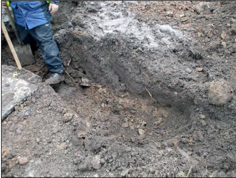
Plate 3: Trench 3, work in progress