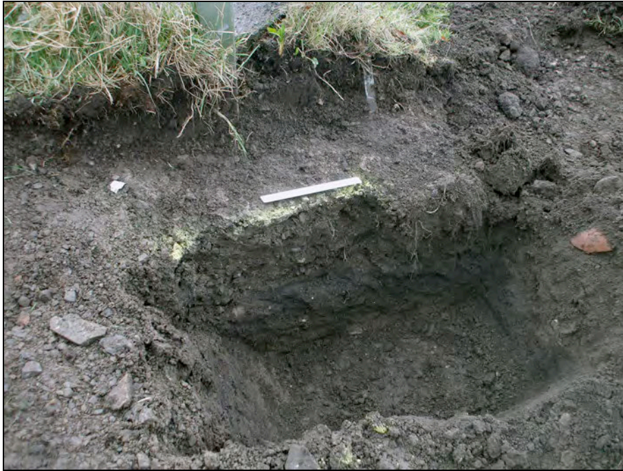
Plate 2: Trench 2, E-facing section