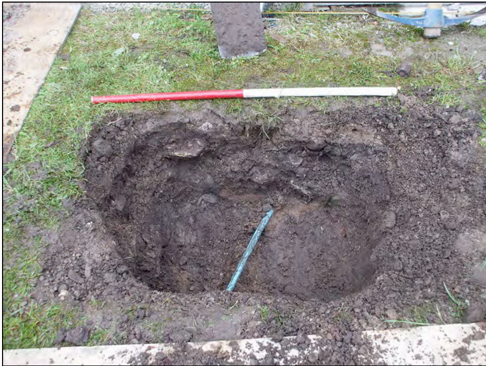
Plate 1: Post-excitation shot of the trench

Following cleaning of the trench it became apparent that backfill 102 , sand 103 and the pipe 104 were sitting within a cut 105 some 60cm wide at the top x 40cm wide at the base. This cut, obviously made to install the water pipe, had truncated (to the NW and SE), a compact layer 106 of silty clay containing sub-rounded pebbles (<12cm) and charcoal flecks, representing either a layer of historic make-up or (potentially) a cobbled surface, as would be expected in a late 19 th Century steading courtyard (a cobbled surface is present in one of the steading buildings to the NW).