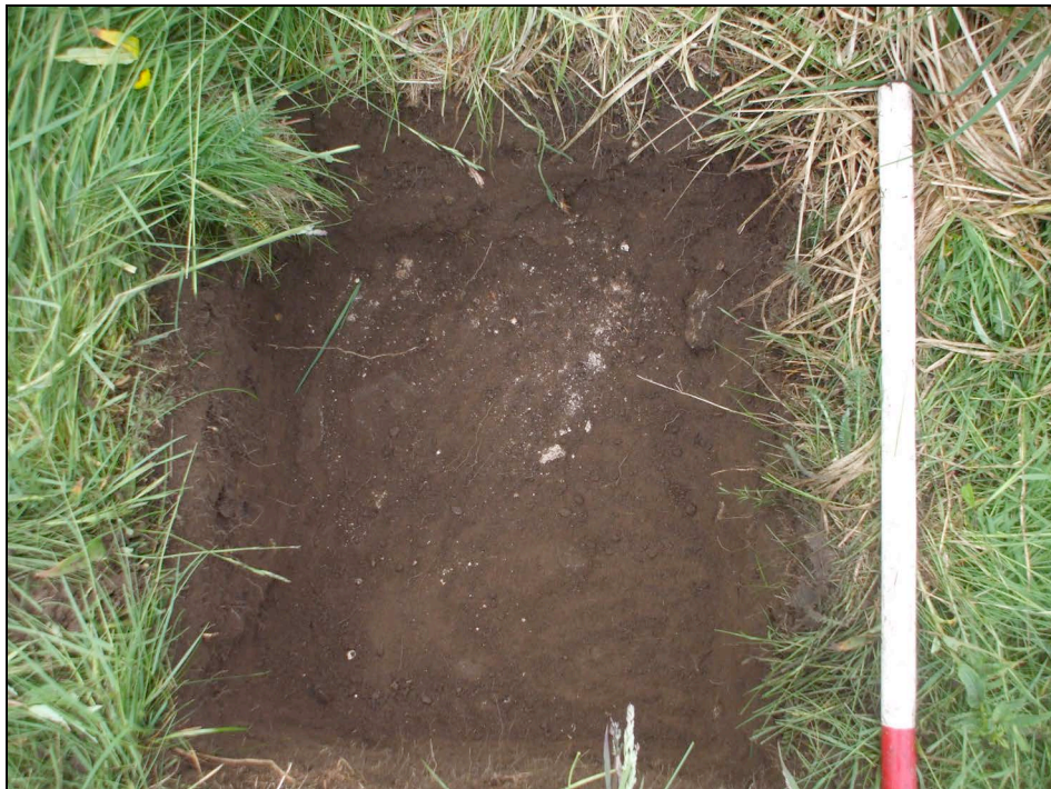
Plate 1: Post-excitation shot of the trench

The trench measured 0.6m NW/SE x 0.45m SW/NE x 0.3m deep, and was located just off the summit of Castle Hill, in an area of longer grass (Fig.2). The position was picked so as to minimise the possibility of encountering in situ burials. It would also allow the marches stone to be viewed from the gathering point within the chapel. A 9cm deep turf 101 covered an 11cm deep layer of moderately compact mid-brown silty topsoil ( 102 ) flecked with charcoal and containing occasional small sub-angular stones (<7cm). There were numerous rootlets throughout. A further layer 103 of more compact light-brown silt, some 10cm thick lay below, flecked with more charcoal. At the required trench depth, this was clearing onto a layer of creamy white mortar 104 with occasional small sub-angular stones (<7cm). No finds were recovered from any of the horizons and further investigation of 104 was not pursued.