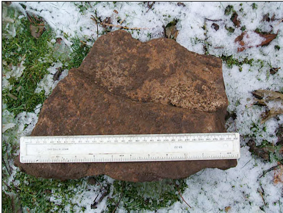
Plate 2: The dressed sandstone (010)