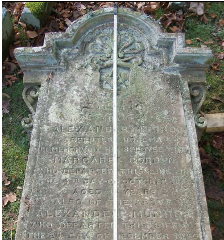
Plate 4: Grave Marker 03