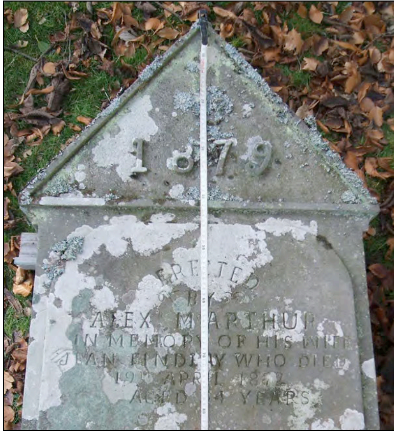
Plate 3: Grave Marker 02