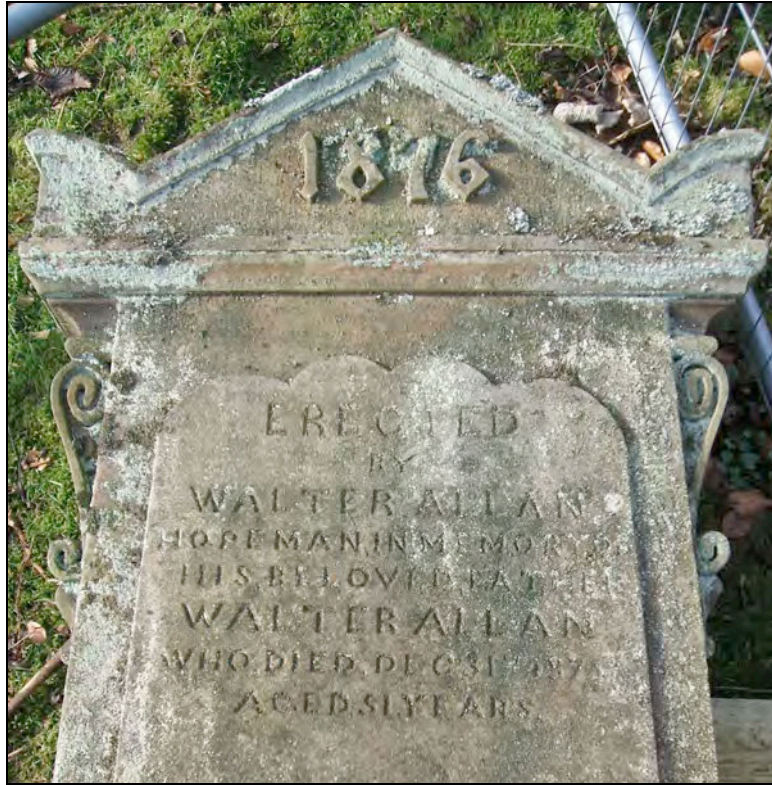
Plate 1: Grave Marker 01