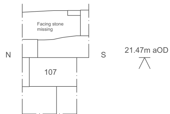
Figure 6: Exposed elevation of Castle foundation wall within Trench 1