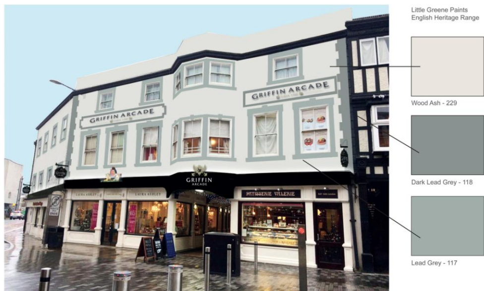
Griffin Planning Update 2015. Page 6.