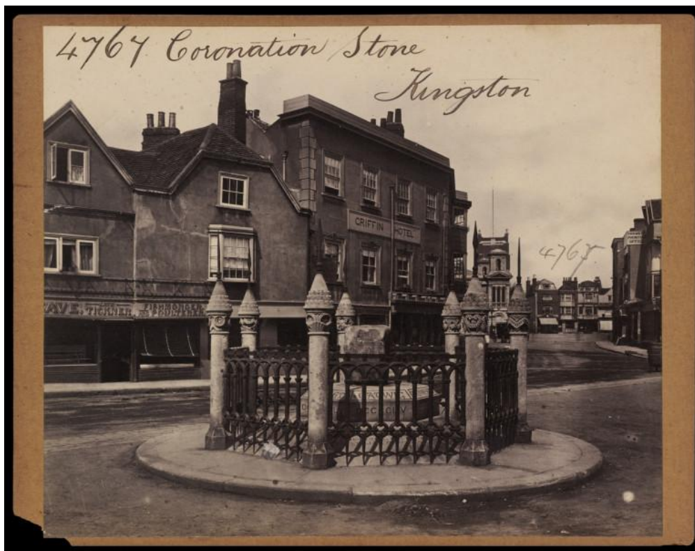
Undated but before 1897.

In 1890 and 1893 the Griffin Hotel does not have the Trade Sign. Instead there is banner sign saying Griffin Bar picked out in red on this hand coloured post card. The swing sign shown in the 1858 engraving is still in position and windows now have deep architraves.