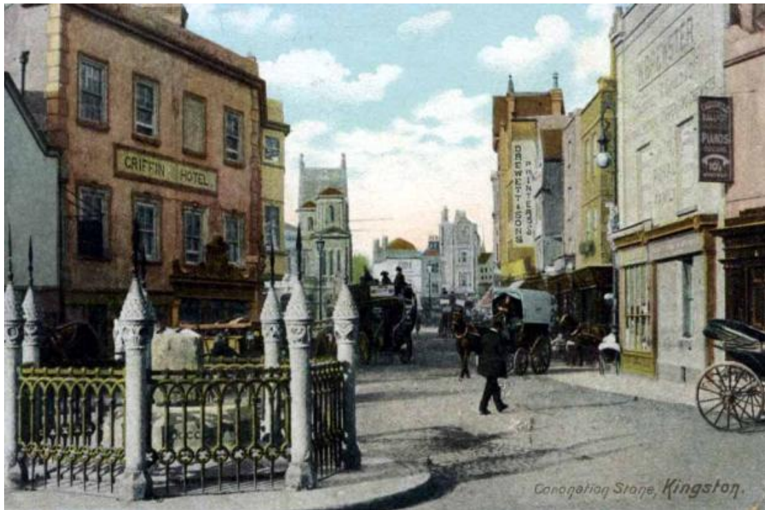
Undated but post 1893.