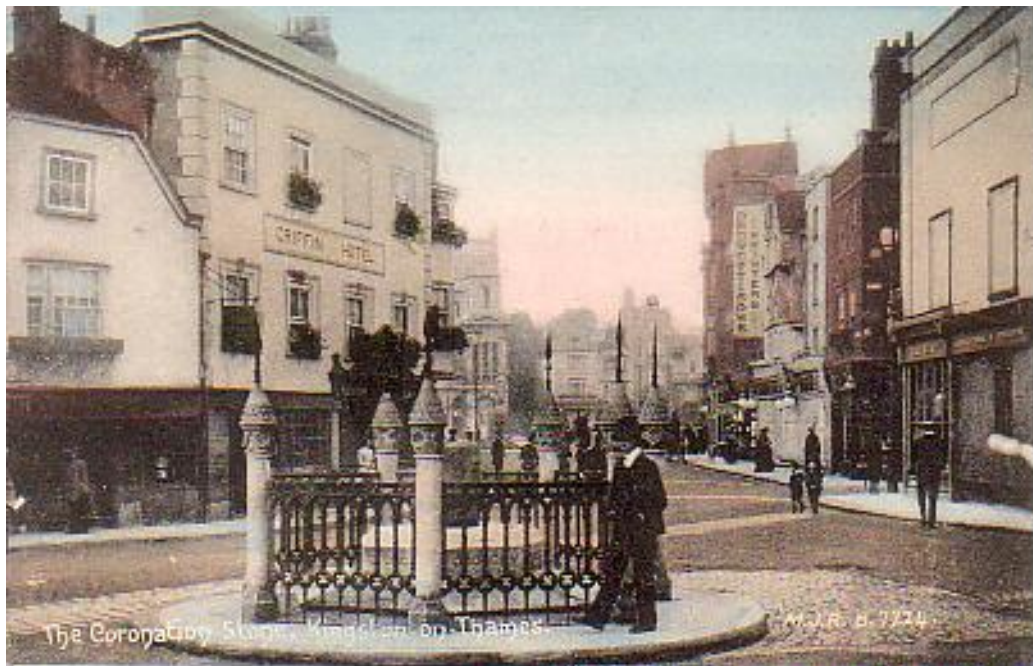
1911. Post card of the Coronation Stone.