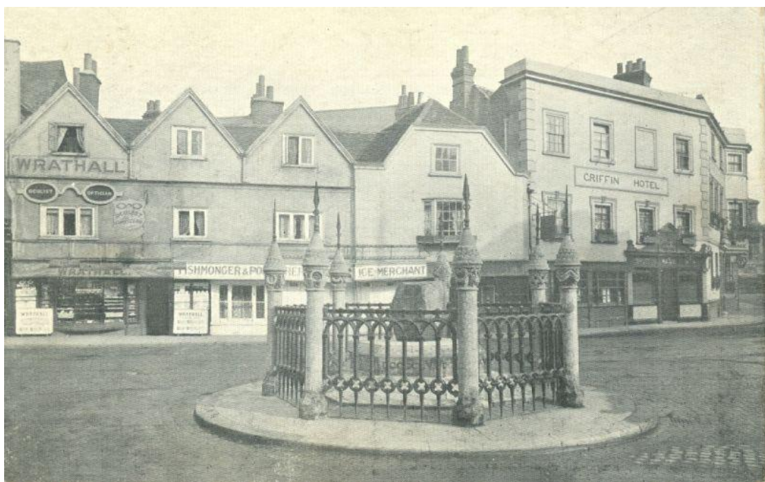
Undated but post 1893.

These turn of the century photographs show the Trade Sign as part of a decorative shop front. The hand coloured postcard shows the Trade Sign in brown.