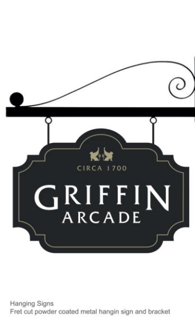
Hanging Signs Fret cut powder coated metal hangin sign and bracket