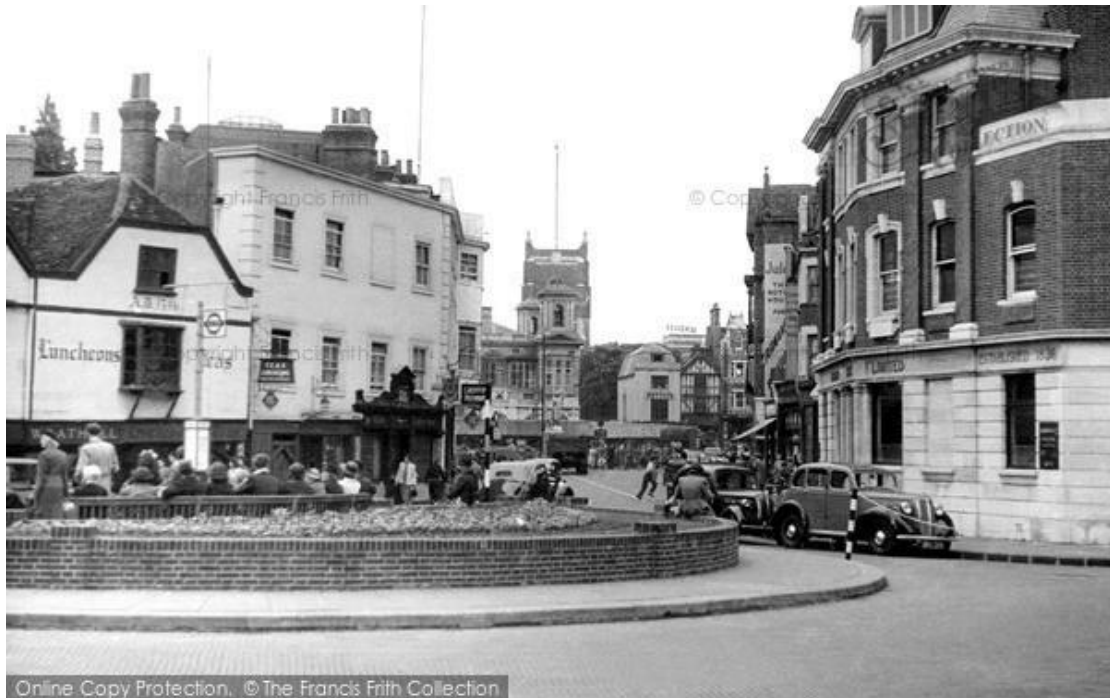
1950.