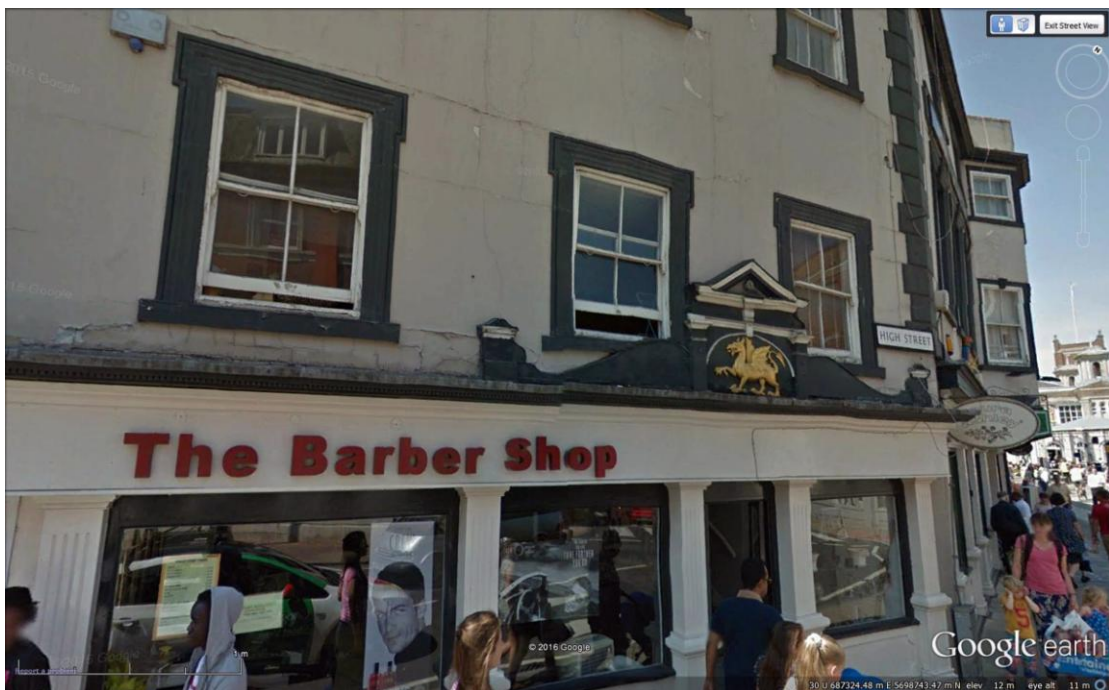
July 2015.