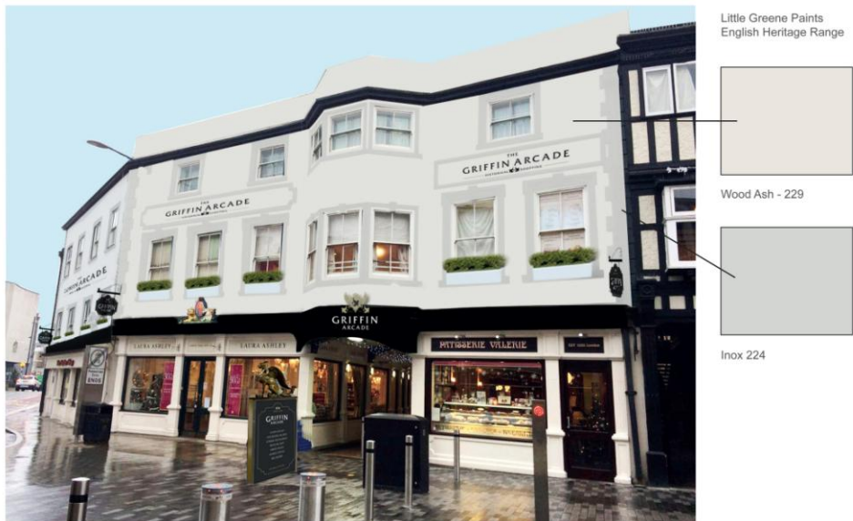
Griffin Planning Update 2015. Page 5.

GRIFFIN ARCADE_EXTERNAL FASCIA TREATMENT