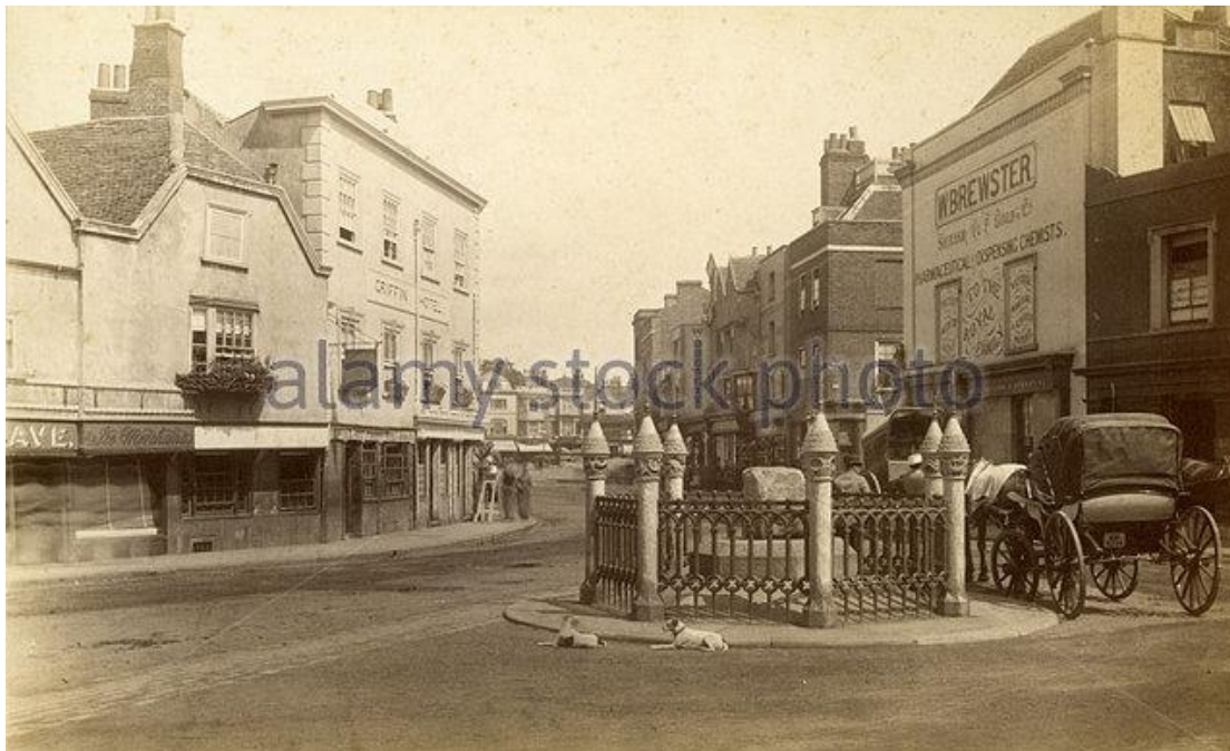
1890. The Coronation Stone and Griffin Hotel. Used under Fair Use Policy.

The image of a football match in the Market Place shows the Coronation Stone in the LHS foreground. This is an important reference point for finding relevant images. The Trade Sign is not shown on the Griffin instead there is an ornate shop front.