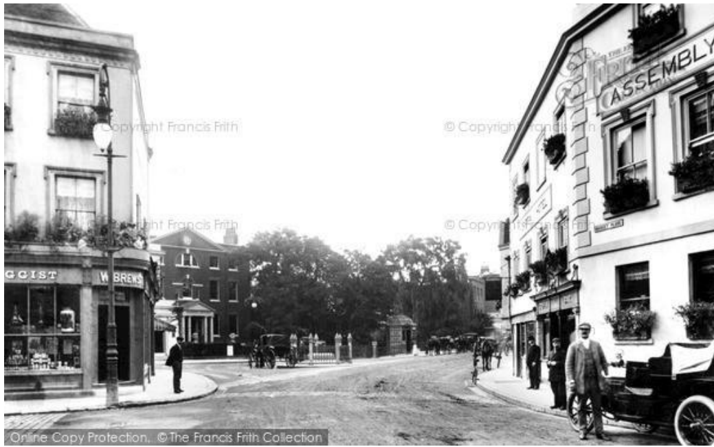
1906. A rare shot looking south.