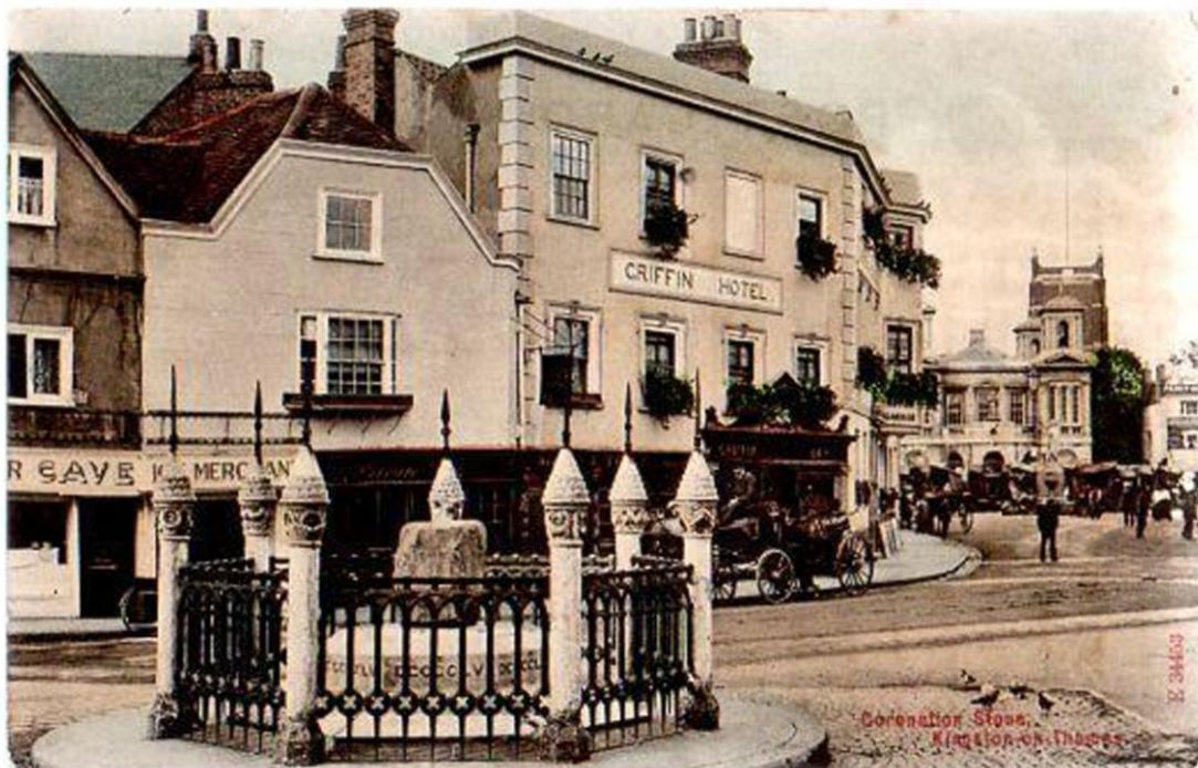
Undated but post 1893.

The Trade Sign appears in this photograph as part of a shop front.