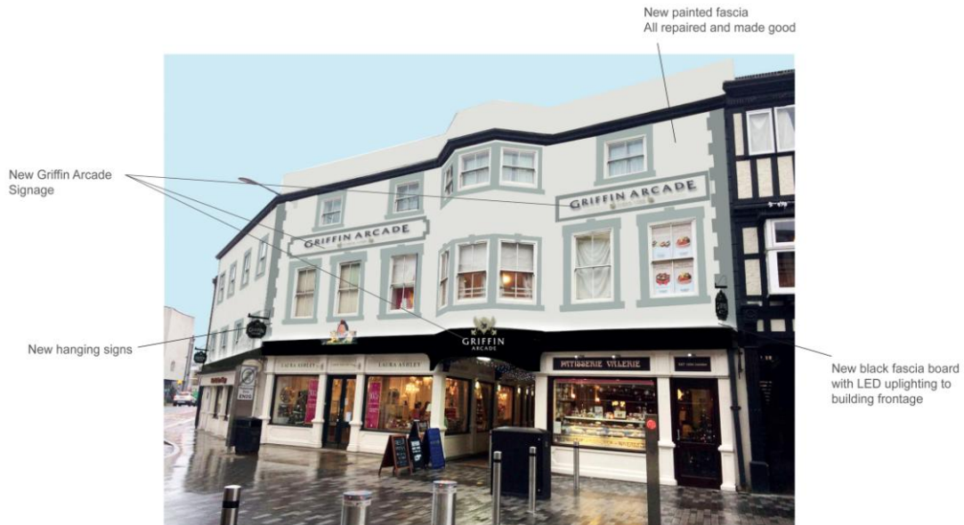
Griffin Planning Update 2015. Page 7.