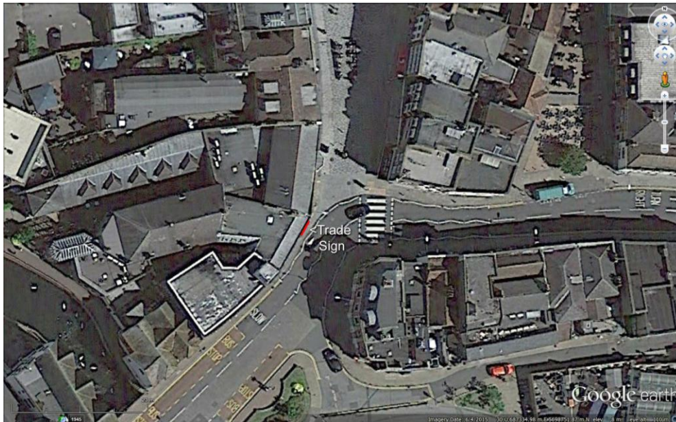
2016 Google earth. Detail of the site showing the location of the trade sign.