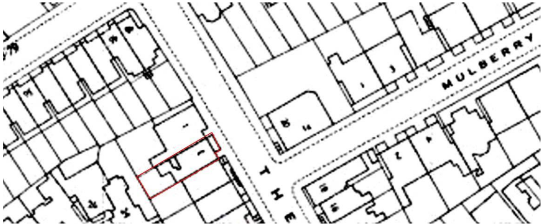
1952 Ordnance Survey. The house has a rear extension.