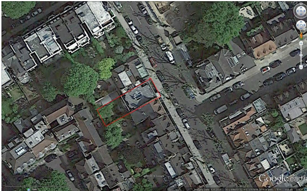
Detail of the site showing the building under study.