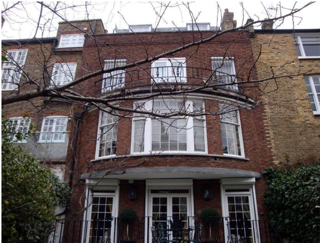
The upper floors of the rear elevation.

The rear elevation retains no original (to 1911-1913) windows as it has been altered in the LC20th (it is believed in the 1960's).