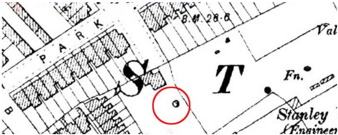
1896 Ordnance Survey. The location of the site.