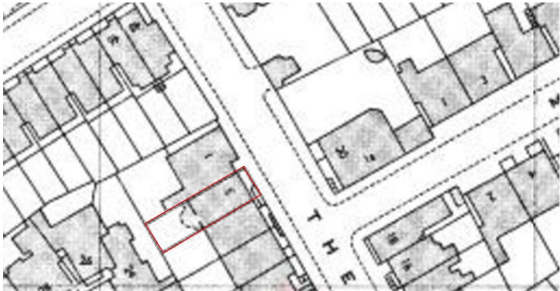
1987 Ordnance Survey. The bow front extension is shown.