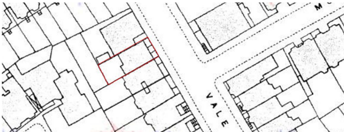
1914 Ordnance Survey. The house has been built.