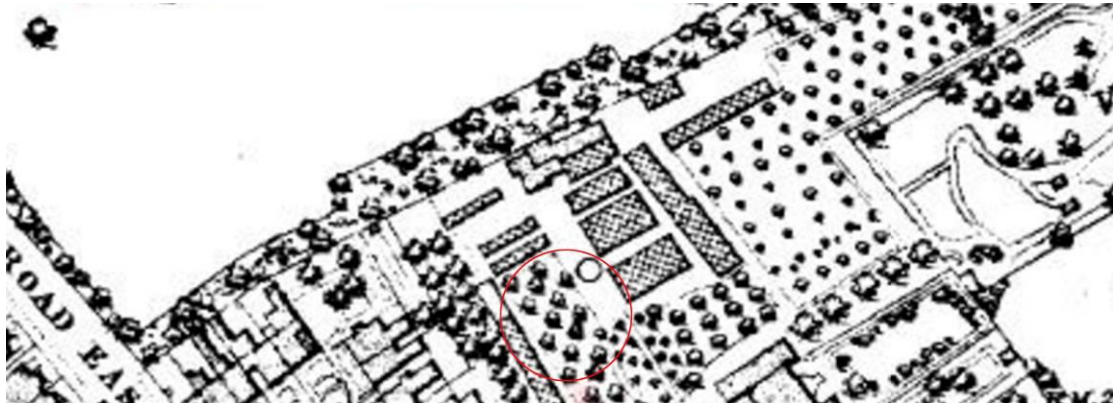
1875 First Edition Ordnance Survey. The location of the site.