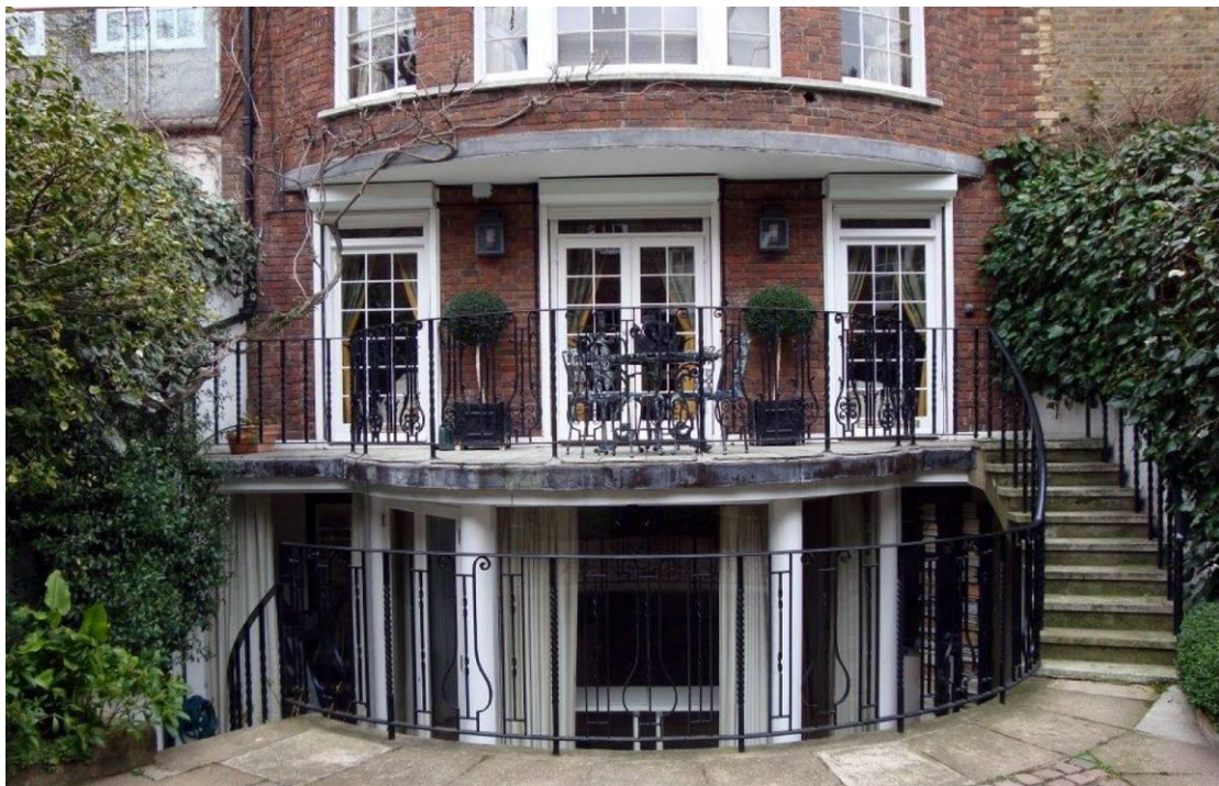
The lower floors of the rear elevation.

The rear elevation retains no original (to 1911-1913) windows as it has been altered in the LC20th (it is believed in the 1960's).