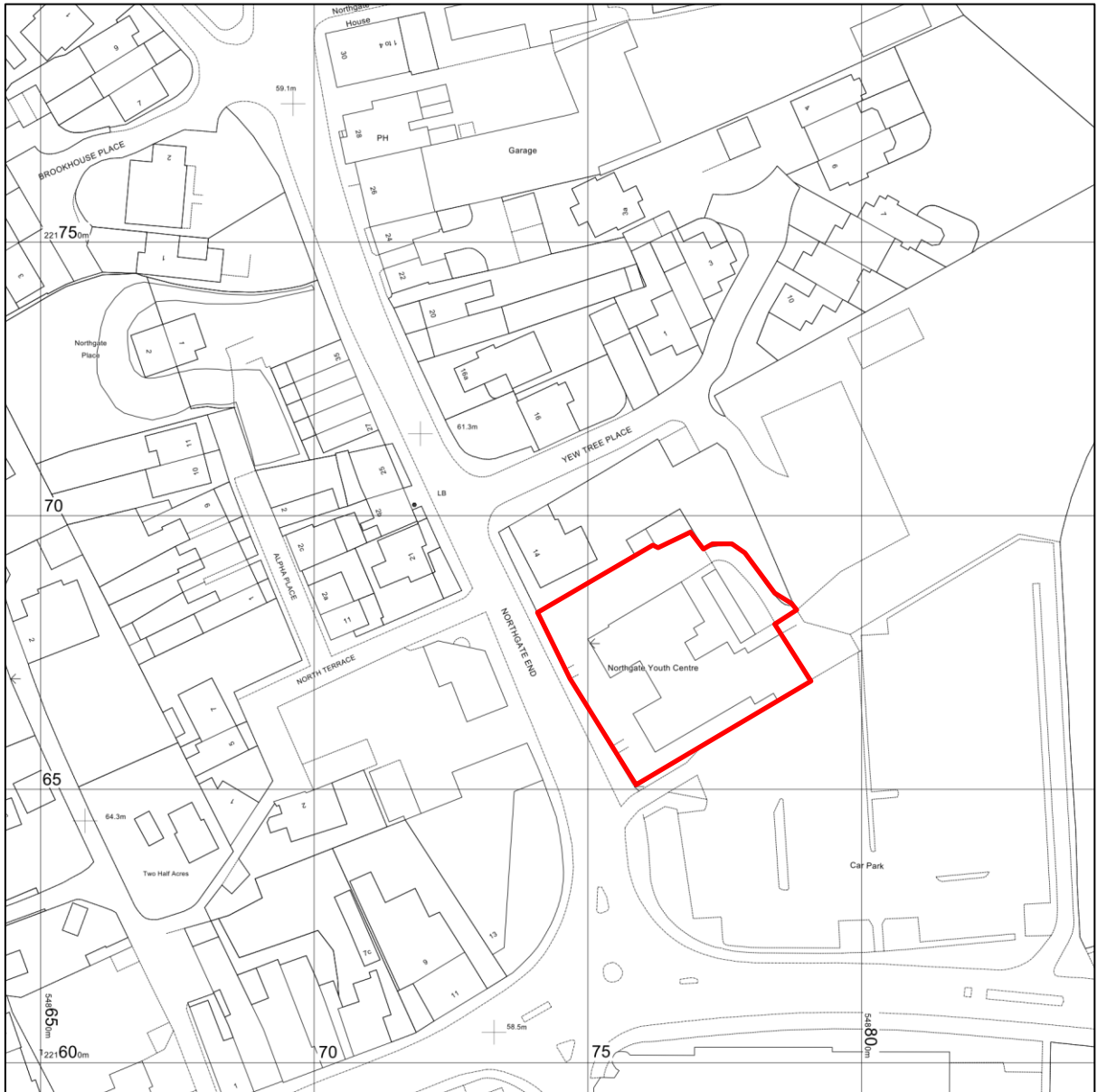
Figure 2: Site location (scale 1: 1250)