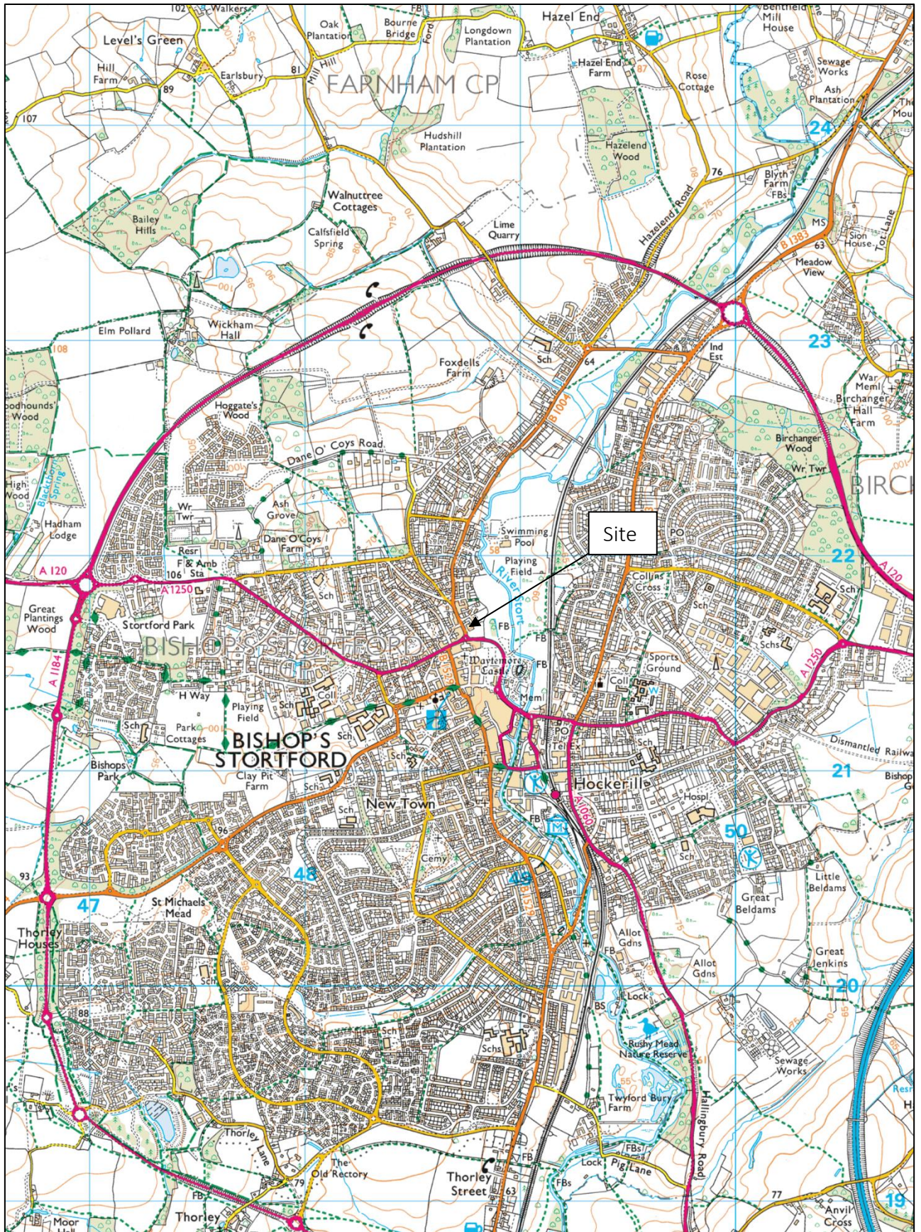
Figure 1: General location (scale 1:25,000)