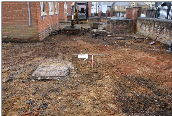
Plate 3: After tarmac removal, looking SE