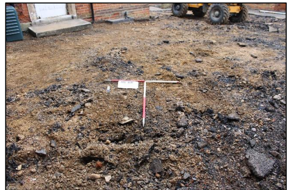
Plate 4: After tarmac removal, looking SW