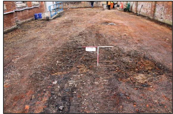
Plate 2: After tarmac removal, looking SW