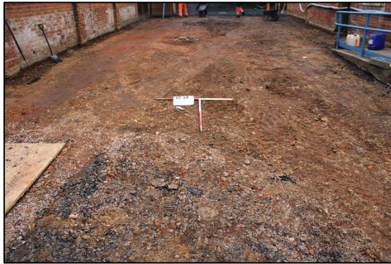
Plate 1: After tarmac removal, looking NE