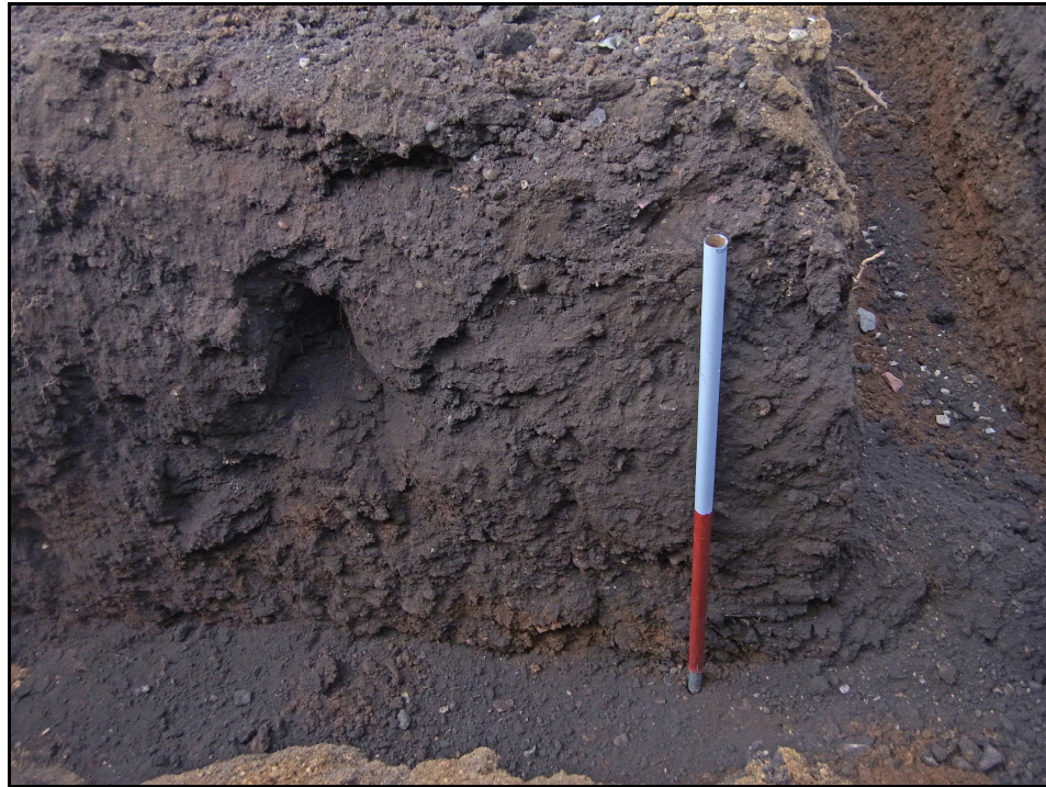
General stratigraphy Fig 3