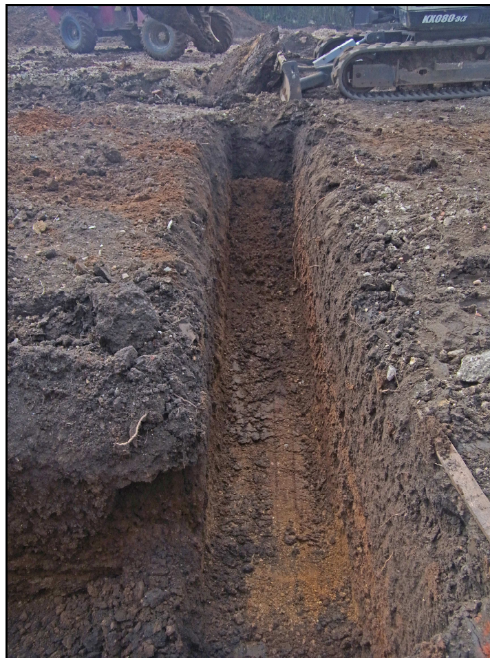
Excavated foundation trench Fig 4