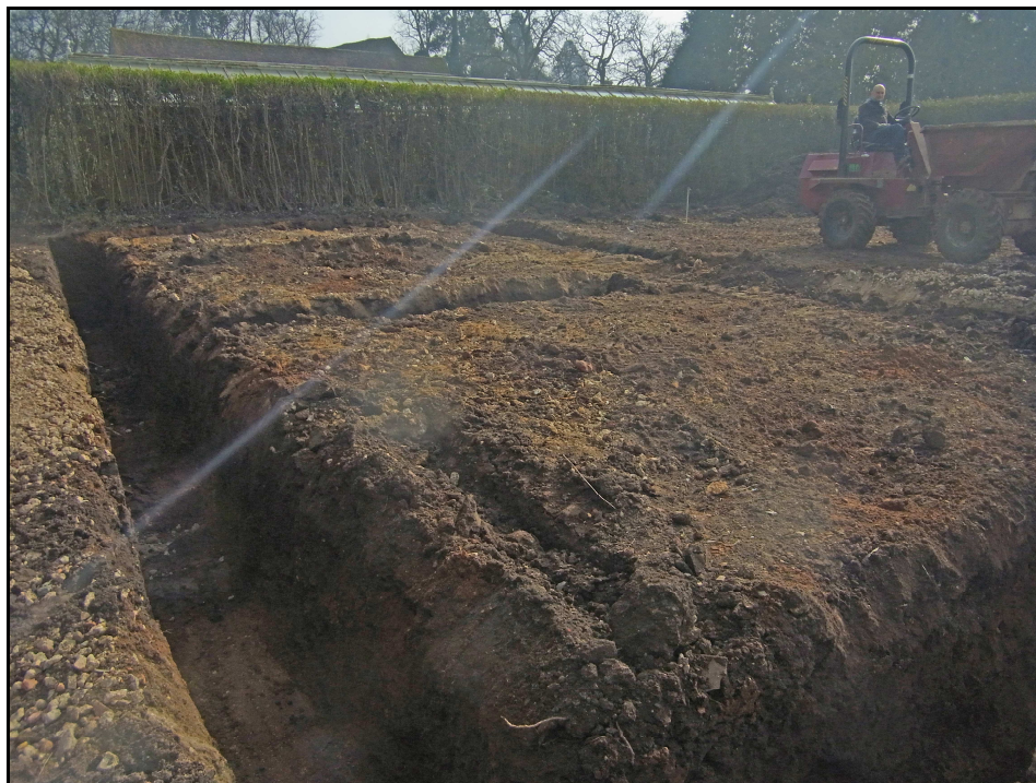
Development area, looking south-east Fig 2