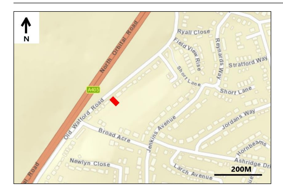
Figure 2. Site Location.