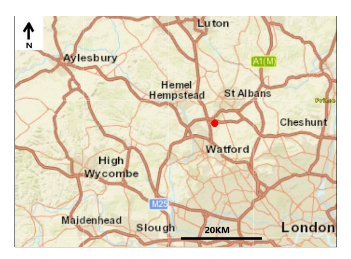
Figure 1. The location of Bricket Wood in England.