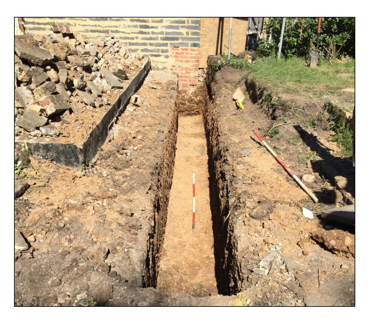
Figure 4. Footings in the east. The natural deposits in the trench showed no traces of archaeological features. North facing photo.

7.1 The watching brief carried out at 69 Old Watford Road, Bricket Wood, Hertfordshire uncovered no features or finds of archaeological interest within the development area. This negative result may, however, be a result of the extensive road works along the Old Watford Road, which took place in the 1950's. The site is nevertheless located in an area of archaeological potential and future investigations in the vicinity may still expose remains of archaeological interest.