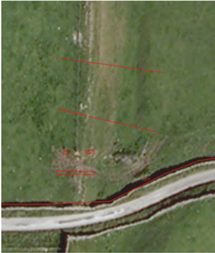
Figure 2 Phase 1 trenches and profiles location