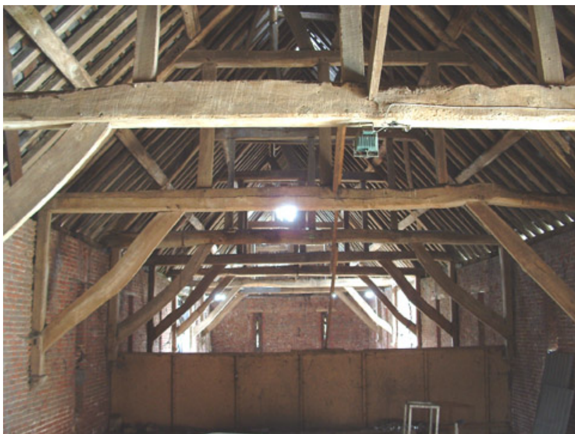
Figure 2: View from the platform at the west end, looking east

Φ = Cores broke up and it was not possible to determine the number of rings