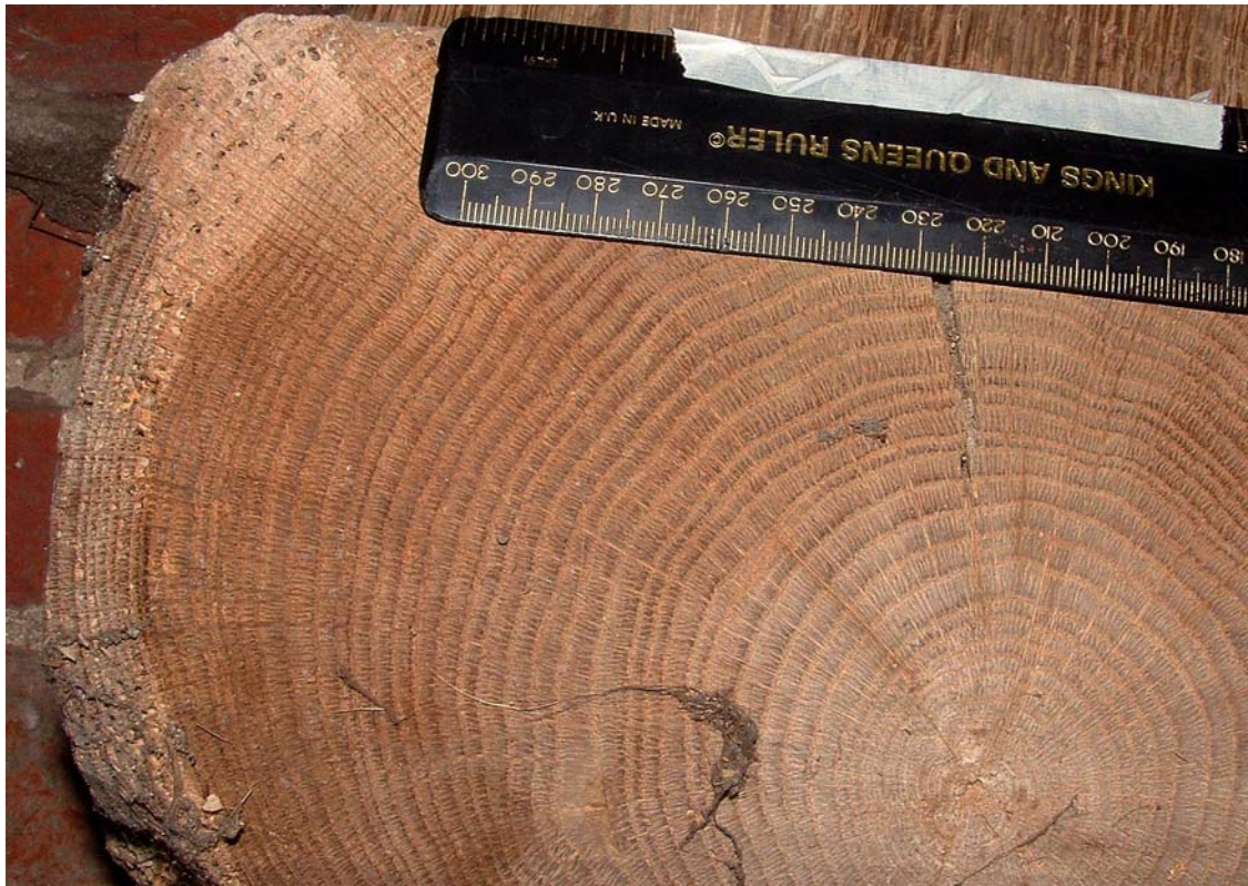
Figure 3: Photograph of HOW06 , the corbel to truss 7 on the south side