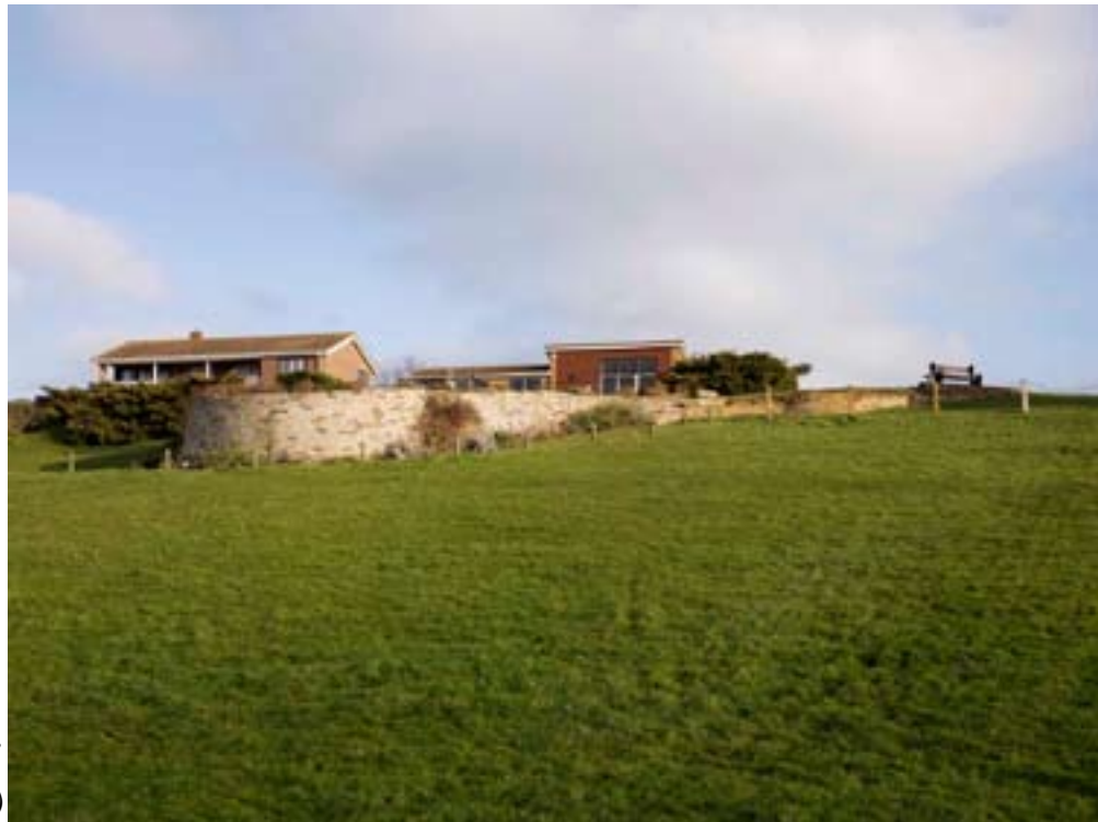
Figure 2: A Photograph of Battery B, Point Clear, Essex (NMR: DP029604)

Tower B, Point Clear, Essex , (NGR: TM 0951 1474) was built with a moat and glacis and supported a forward battery of three guns, it was demolished in 1967 to make way for a housing development. The site of the tower is still visible as a slight earthwork on a patch of open ground adjacent to number 6 Beacon Heights, the forward battery survives, in the garden of number 6, to a height of nearly 1m in places and is preserved to some extent over approximately two thirds of its original length. Some of the coping stones from the tower's parapet and a Board of Ordnance land marker still survive although not in situ. The remains of the battery are now an extremely rare feature. The extent of the original land parcel can still be discerned from modern maps of this area; the Beacon Hill Estate is built entirely within the lands of the tower.