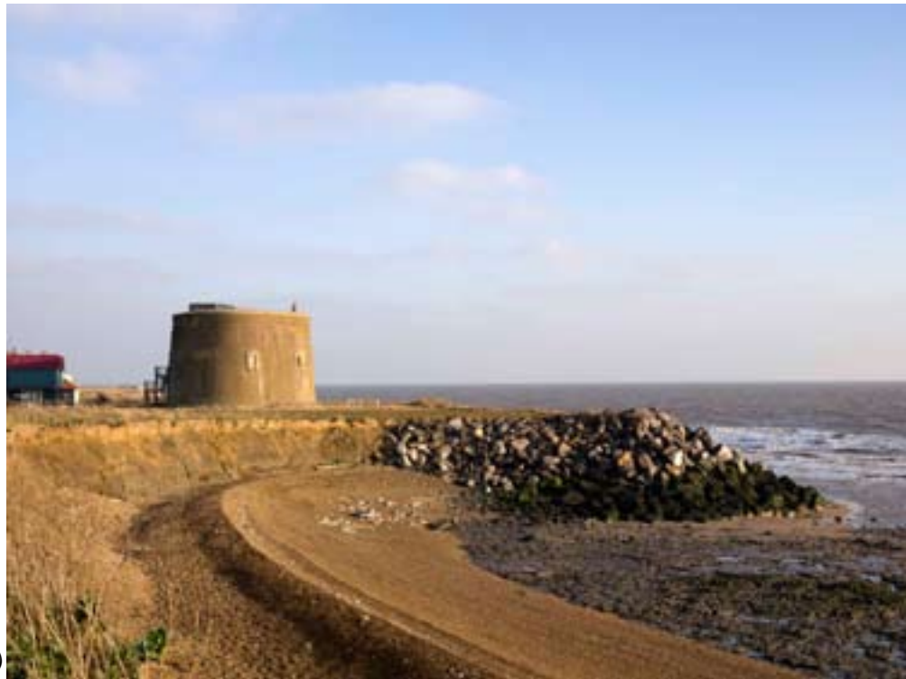
Figure 4: A Photograph of Tower W, Bawdsey, Suffolk (NMR: DP046352)

Tower X, Bawdsey, Suffolk, (NGR: TM 3580 4024) was built with a large ditch surrounding it. There were no traces of this tower surviving; it has been lost due to a combination of coastal erosion, and changing landuse such as the creation of lakes in this area. A coping stone was noted adjacent to this site in 1991 by Robert Carr of Suffolk County Council.