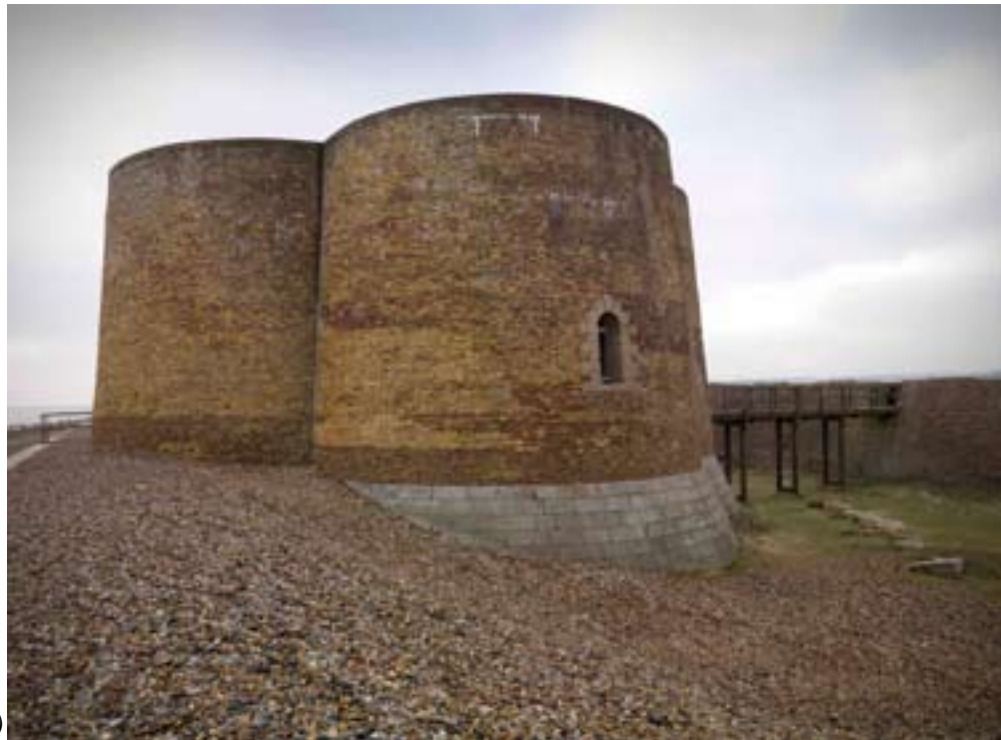
Figure 6: A Photograph of Tower CC, Aldeburgh, Suffolk