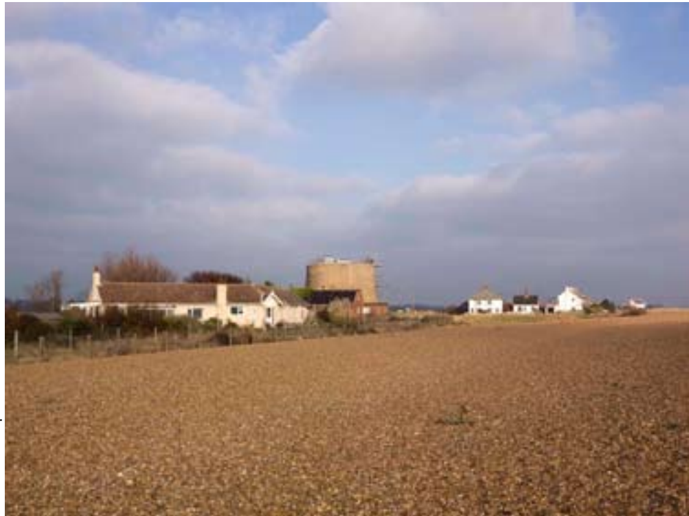
Figure 5: A Photograph of Tower AA with converted Battery in foreground, Shinglestreet, Suffolk (NMR: DP046362)

use and the rear half of the land parcel was delimited by a bank and ditch which survives intact, the associated boat house and a large depression, both shown on the 1860s plan, were still present as earthworks as well as all four of the original Board of Ordnance boundary markers. The tower is still surrounded by the slight earthwork of its ditch and was undergoing renovation so that it could be used as a house. The tower is in good overall condition and is the most complete site encountered as all of the ancillary buildings can be accounted for.