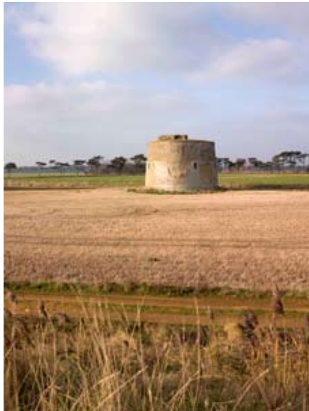
A Photograph of Tower Z, Alderton, Suffolk (NMR: 046358)