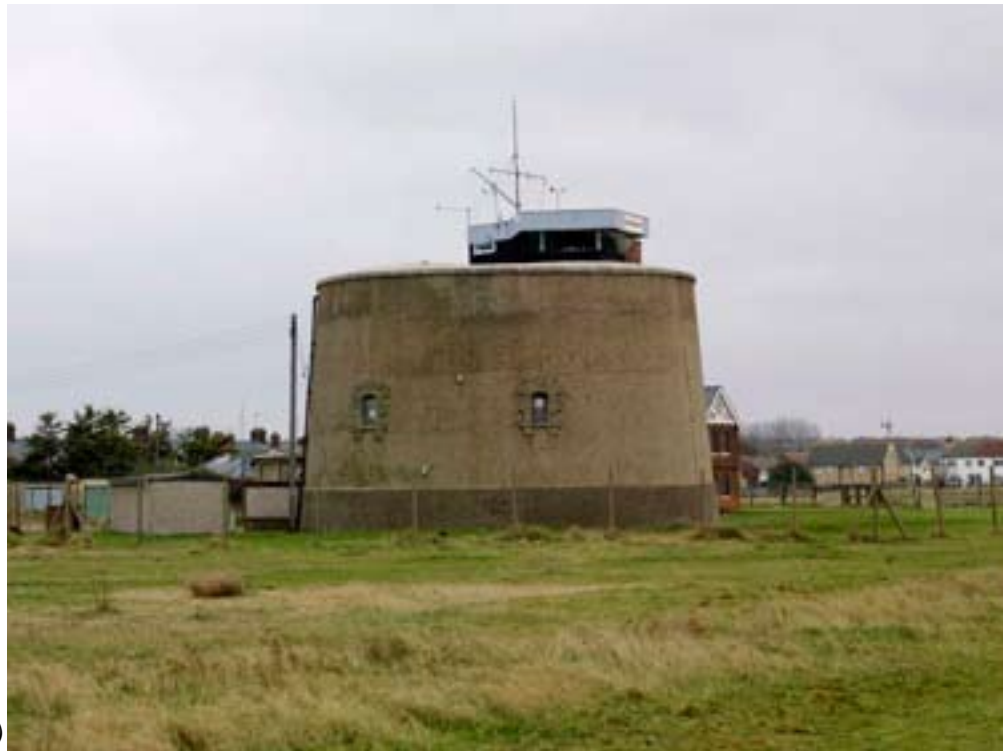
Figure 3: A Photograph of Tower P, Felixstowe, Suffolk (NMR: DP029607)

Tower P, Felixstowe, Suffolk , (NGR:TM 2927 3308, scheduled and grade II listed) was built with a ditch. There is still slight evidence for the ditch around the tower; the observation point adjacent to the tower survives as a subtle platform. The lifeboat house and gun shed shown on the 1860s plan both also survive as platforms, it seems that coastal erosion has not adversely affected this area. The tower has a National Coastwatch observation point on the roof. The tower is pebble dash rendered which looks slightly weathered but the tower is in sound overall condition. The