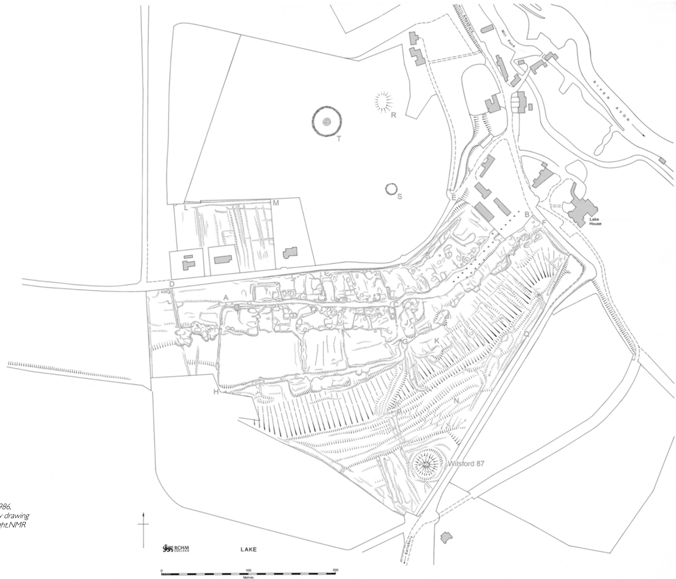
Fig 3: Earthworks at Lake, 1986, reduced from original survey drawing at 1:1000.