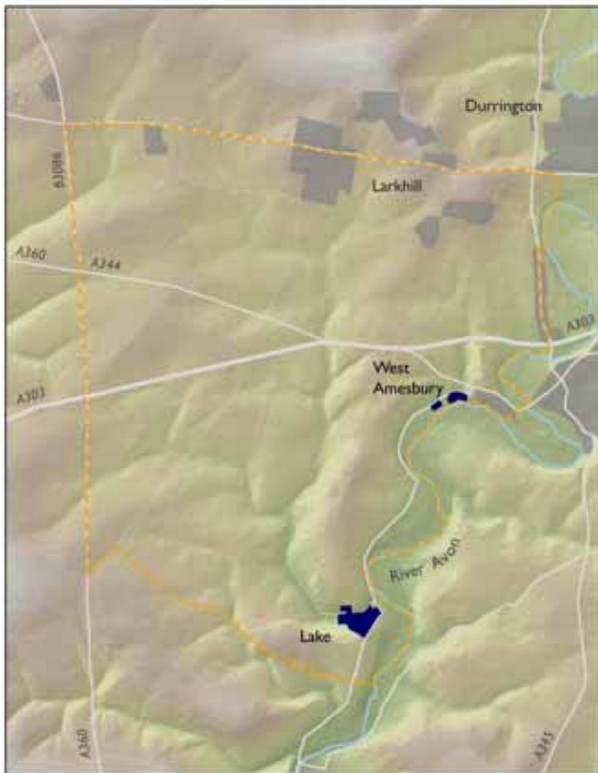
Fig 1: Location map showing the earthworks at Lake and West Amesbury within the Stonehenge World Heritage Site (boundary shown by broken orange line).

Two sets of medieval and early post-medieval earthworks on the south-eastern boundary of the Stonehenge World Heritage Site, at Lake and West Amesbury (Fig 1), were investigated by the Royal Commission on the Historical Monuments of England in 1986, as part of that organisation's programme of work in South Wiltshire. Reports on those investigations were prepared by Carenza Lewis and Paul Pattison in 1992 but remained as unpublished archive documents. This report is based on Lewis's and Pattison's work with some additions resulting from subsequent research and has been prepared as part of English Heritage's Stonehenge WHS Landscape Project.