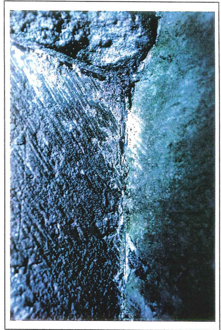
Detail, traces of single black-line masonry pattern