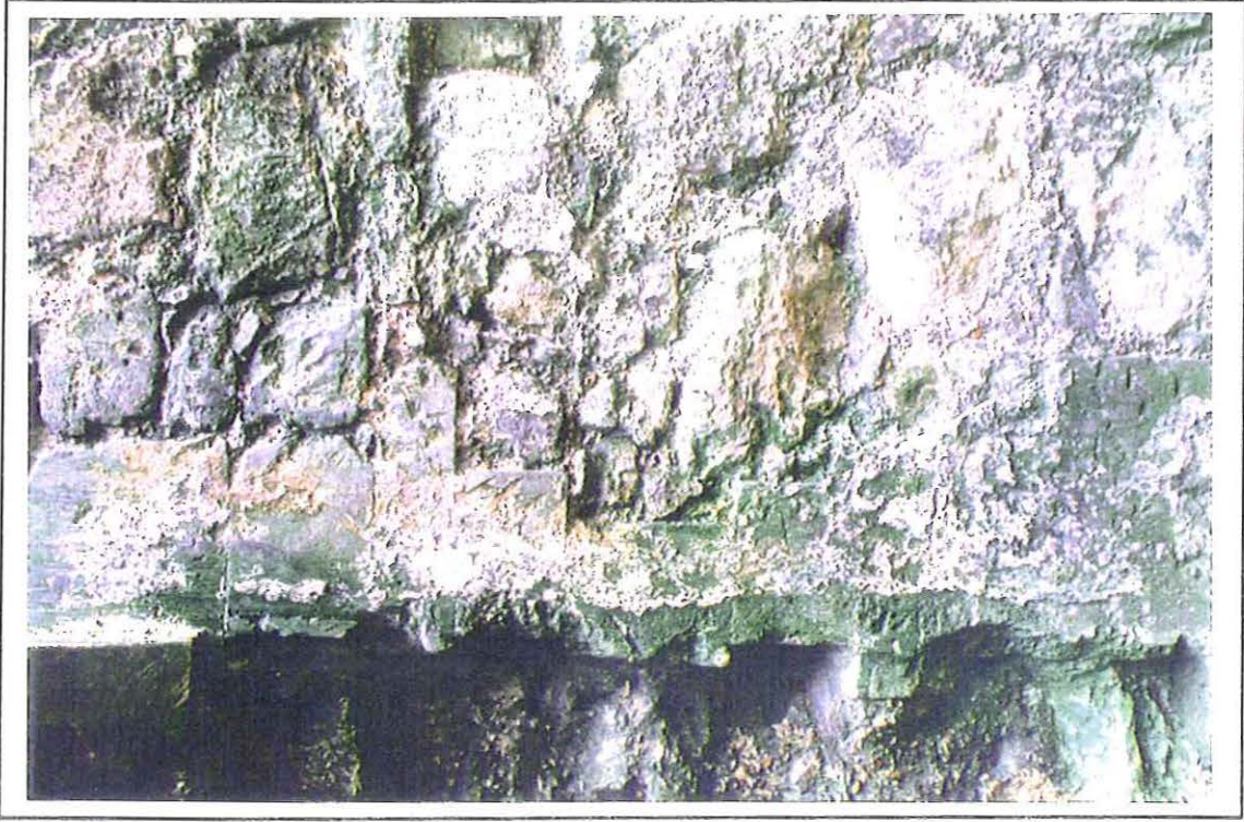
West wall, south corner