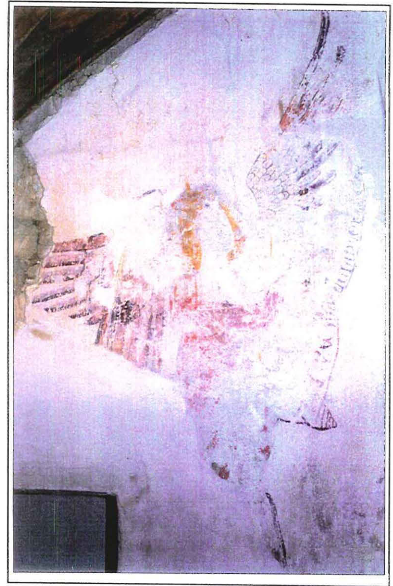
Detail, archangel Gabriel, west side of north wall